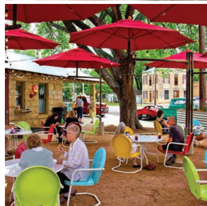
(From top) Little Gretel in Boerne; Comfort Pizza in Comfort; 814 A Texas Bistro in Comfort