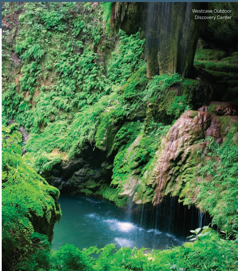
Westcave Outdoor Discovery Center