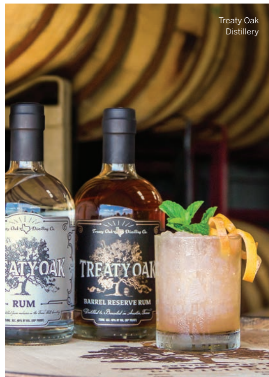
Treaty Oak Distillery

DRINK Twisted X Brewing Co., 23455 W. Ranch Road 150, twistedxbrewing.com