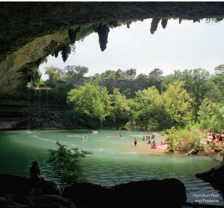
Hamilton Pool and Preserve