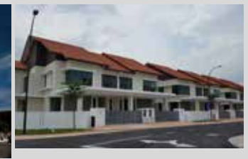
Alam Impian Shah Alam