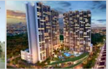
Setia Sky Ville Penang