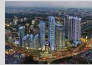
KL Eco City Kuala Lumpur