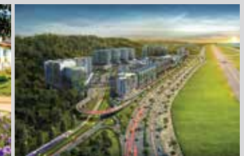
Aeropod Kota Kinabalu