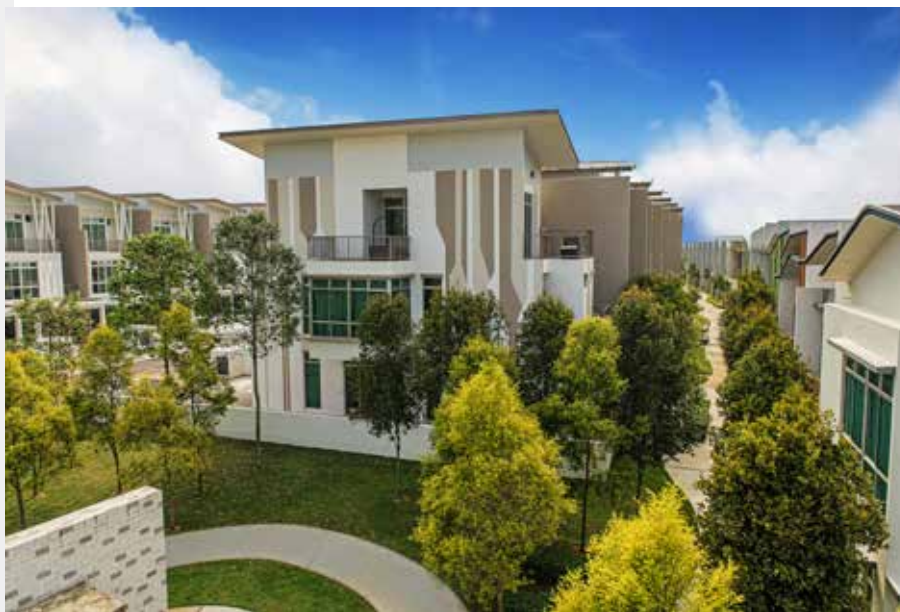
Curvy winding walkways embracing the lush landscape architecture at Setia Eco Cascadia.