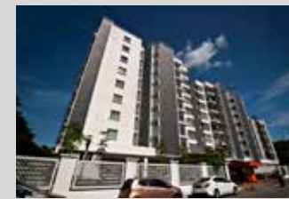
Bandar Baru Seri Petaling Kuala Lumpur