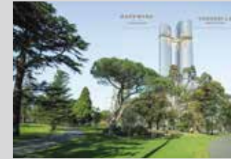
Sapphire by The Gardens Australia