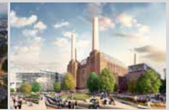
Battersea Power Station United Kingdom