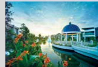
Setia Eco Glades Cyberjaya