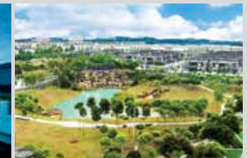
Setia Eco Cascadia Johor