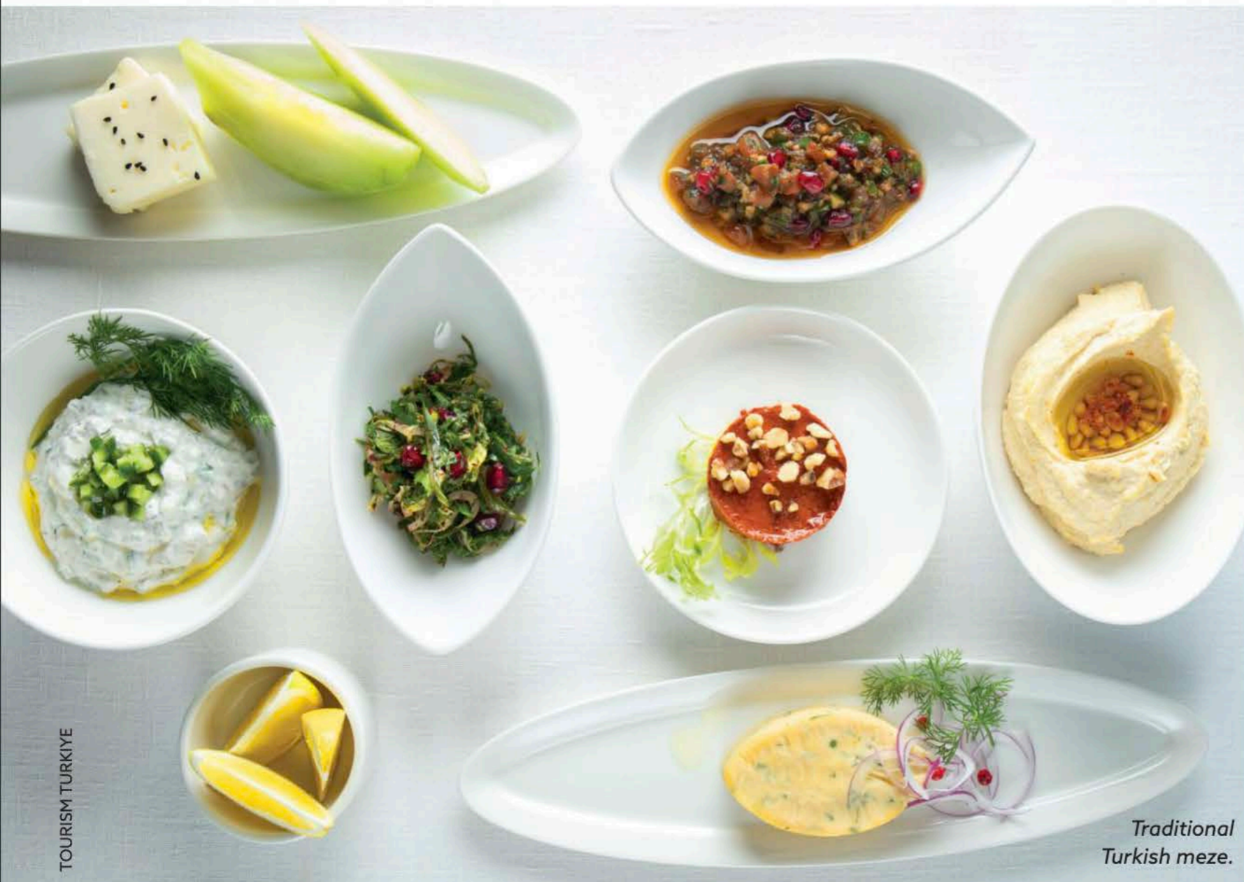
Traditional Turkish meze.

Small dishes of dips, salads and delicious