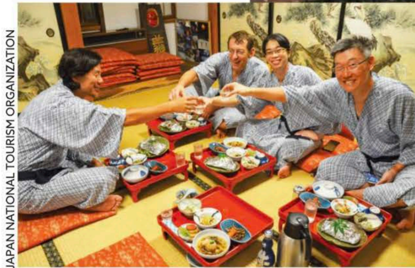
JAPAN NATIONAL TOURISM ORGANIZATION