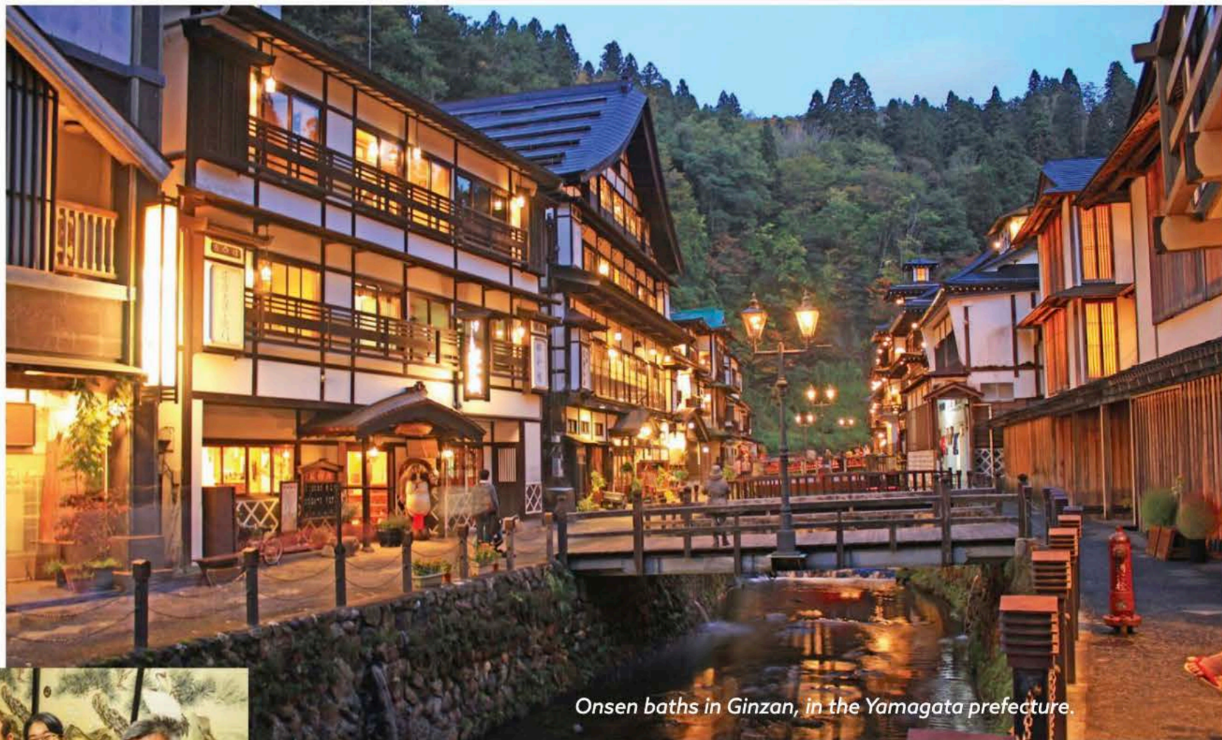
Onsen baths in Ginzan, in the Yamagata prefecture.

Tohoku has the greatest number of relaxing "onsen" baths per capita in Japan. Towns and resorts were established around these hot-springs-fed communal baths (segregated by sex) that soothe body and soul. Ginzan is one of the most picturesque onsen towns, set among waterfalls and mountains in Yamagata