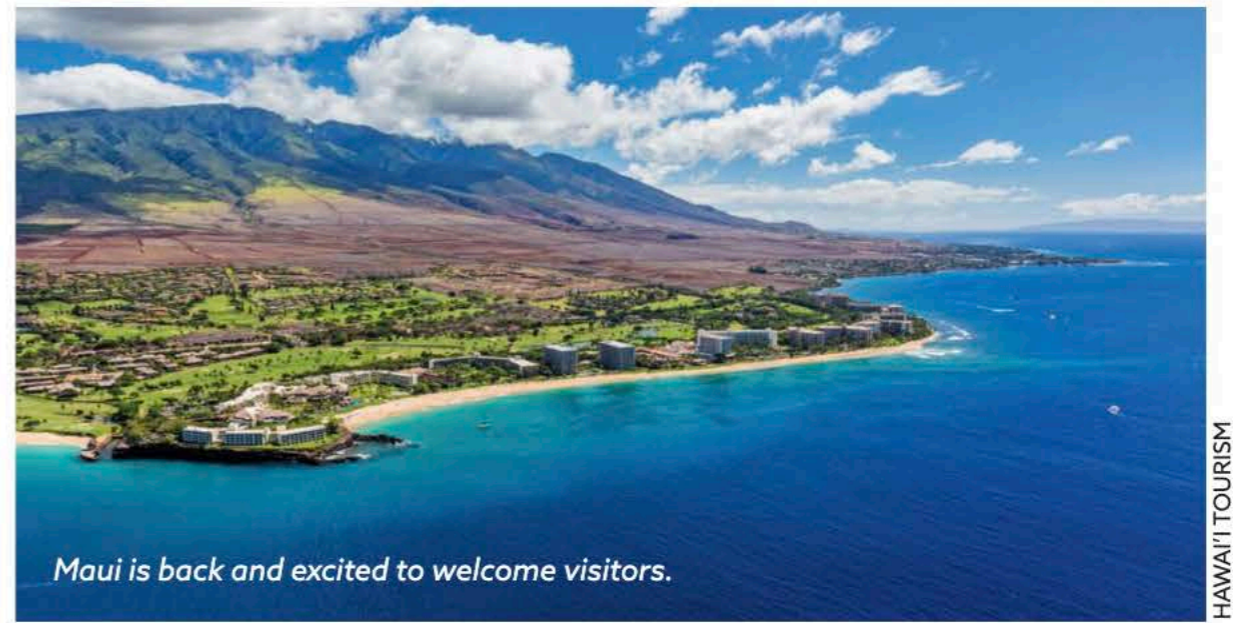
Maui is back and excited to welcome visitors.

Watch Hawaiian green sea turtles glide and dolphins leap on a Teralani Sailing Adventures catamaran trip off Kā'anapali Beach. In winter, this stretch of ocean is prime