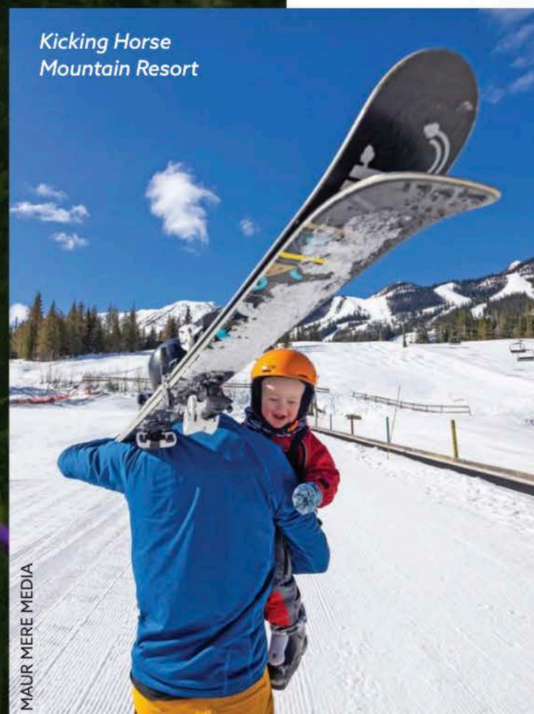
Kicking Horse Mountain Resort