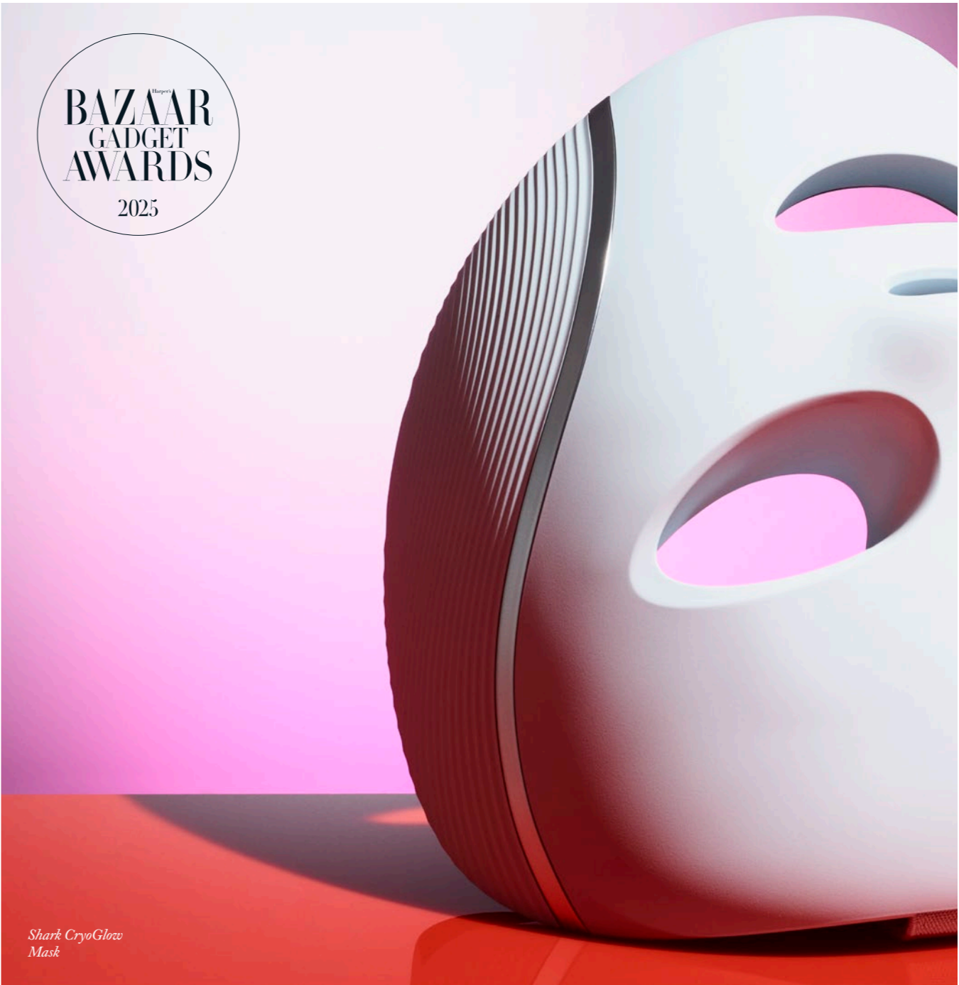
Shark CryoGlow Mask

This compact design sends microcurrents to precise locations on the skin. Select from three areas of focus – eyes, lines and lips – to refresh tired eyes, smooth texture or boost circulation for a fuller pout. □