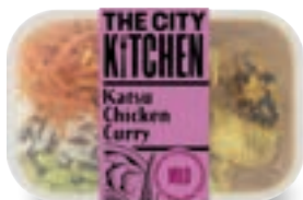
The City Kitchen Katsu Chicken Curry 380g, £3.50 (92p/100g)