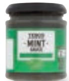
Mint Sauce 185g, 46p (25p/100g)