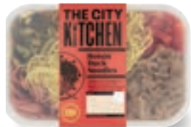
The City Kitchen Hoisin Duck Noodles 380g, £3.50 (92p/100g)