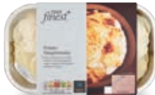
Tesco Finest Potato Dauphinoise 400g, £2.60 (65p/100g)

These go great with the classic Easter main. Turn to p28 for a recipe.