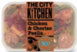
The City Kitchen Chicken & Chorizo Paella 380g, £3.50 (92p/100g)

Dinnertime is sorted with these speedy, globally inspired dishes.