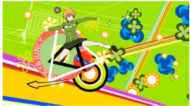
Chie in the new intro

can't make everyone love you. Be who you are. The more truthful you are to yourself- even if someone doesn't like you, they'll respect you."