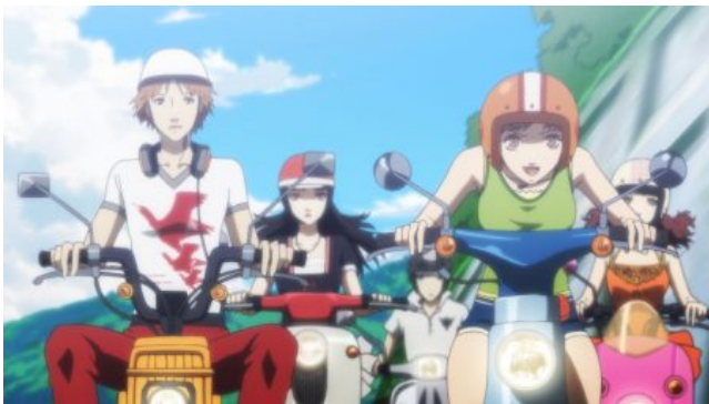
Chie as she appears in Persona 4 Golden the animation