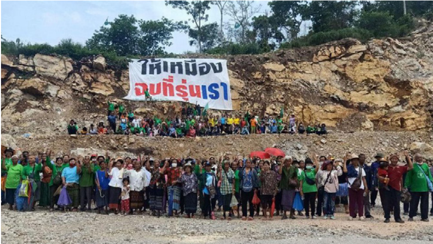
The Khao Lao Yai-Pha Jun Dai Forest Conservation Group celebrates their victory against quarry mining last September 4, 2020.