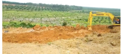
The company taking the Laterite soil.