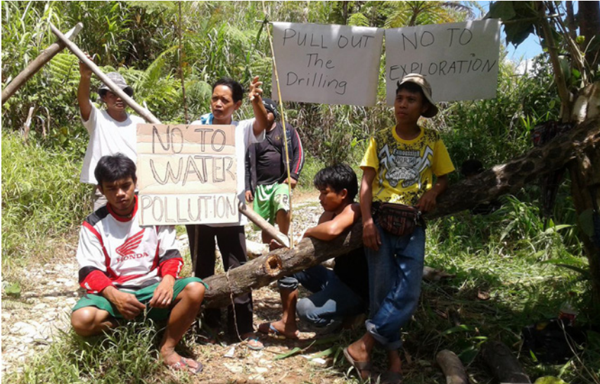
Indigenous Peoples in Didipio rejects Oceanagold drilling exploration.

OGPI's renewal process was slowed down due to the pandemic and was expired in June 2019. However, OGPI contested and stated that according to the Mines and Geosciences Bureau, they could continue their operations despite the pending renewal permit.