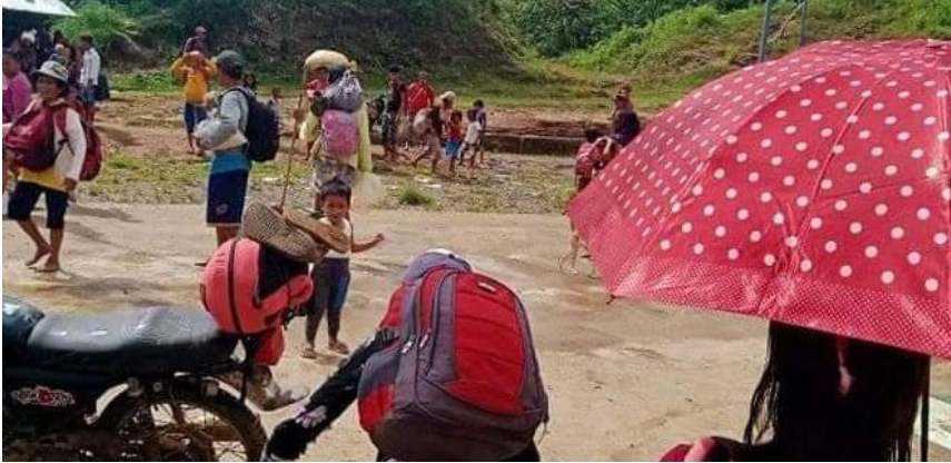
Residents flee their village in Lahug, Tapaz, Capiz after the massacre because of the military's threats.