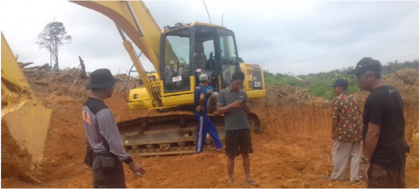
The community stopped the company's activity for taking the Laterite soil.