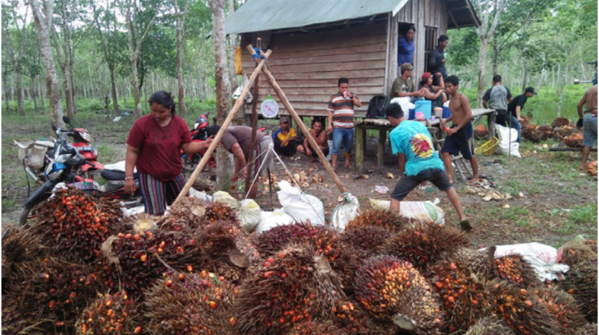
The community reaping their third harvest last 22-23 January 2020.