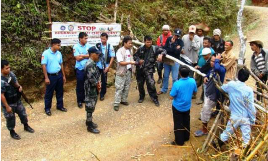
Villagers confront military personnel upon the latter's entry into their community in 2013.