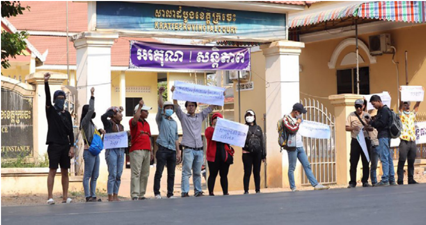
Environmental Defenders held a peaceful protest at the Kratie Province Court after Think Biotech Security arrested and handed the four environmental activists to local authorities on March 13, 2020.

resources. Environment defenders -- from peasants, indigenous peoples, women leaders, and the youth -- have taken the front lines against illegal logging, deforestation, and land grabbing cases enabled by the ELCs. According to The Observatory report, the use of state forces in dealing with land disputes has become “a worrying trend.” Security forces have been known to use threats, harassments, and other intimidation tactics and more severe rights violations such as illegal detention and arrests from trumped-up charges and blatant shooting at peaceful protestors.