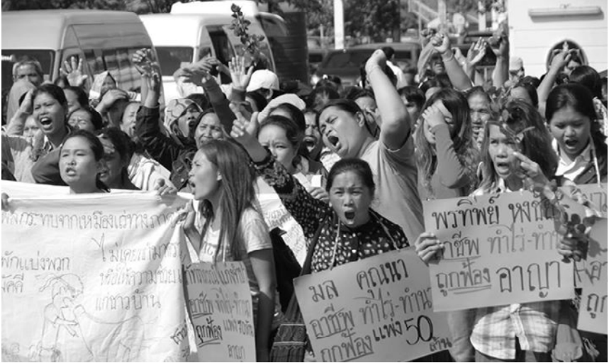
Loei villagers barricaded against Tungcum Ltd. gold mine for contaminating their soil and water.