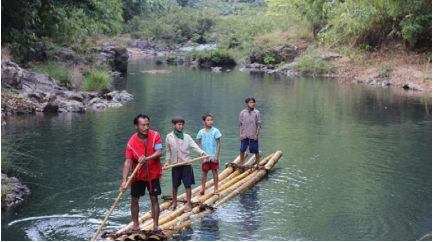
Villagers in the Salween River.