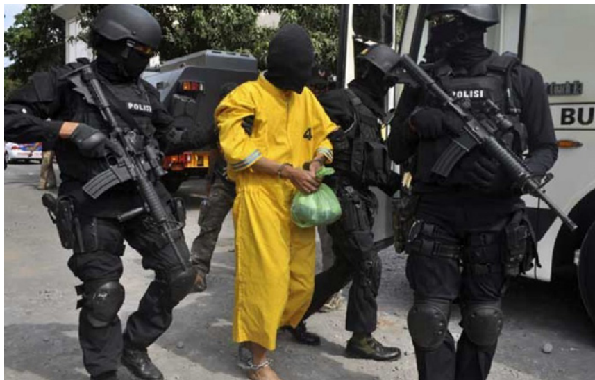
As Indonesia's counterterrorism law revised, they allow authorities to arrests and detain suspected terrorists.

In these and other cases of alleged misconduct, police and the military frequently do not disclose the findings of internal investigations to the public or confirm whether such investigations occur. Official statements related to these allegations sometimes contradict civil society accounts, and the inaccessibility of areas where violence takes place makes fact checking difficult. Nongovernmental organizations (NGOs) and media report that police abused suspects during detention and interrogation.