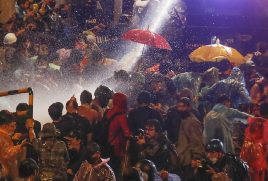
Pro-democracy demonstrators protest in Bangkok to dissolve the Prayut regime, a new constitution, and an end to political repression; faced water cannons as police try to disperse them.

misused its power by clamping down on freedom of expression and assembly. Ongoing protests that began in February 2020 are being violently dispersed by the police, resulting in a running total of more than 70 injured (Masayuki, 2020), 170 arrested (Reuters, 2020), (Khaosod English, 2020), (Associated Press, 2020), and 230 charged (Thai PBS World, 2021).