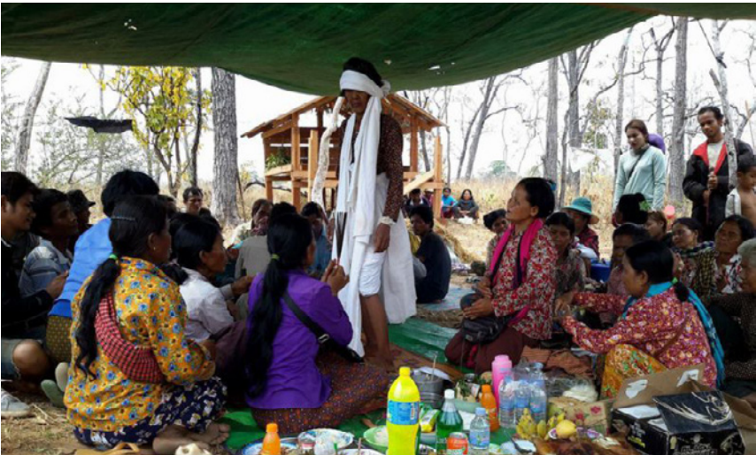
Ethnic Kuy Communities held a traditional ceremony to "call upon the local spirits to curse the companies" who have been clearing the land in Preah Vihear province.

The community actions and other forms of people's response to guard their lands, preserve biodiversity, and defend their environment are laborious, lengthy, and at times dangerous and deadly. Cambodian environment defenders' experience - rural peoples, indigenous peoples, women leaders, and the youth proves that the resources, culture, and wisdom that come with it are worth fighting for. The environment is not only for the present but also for future generations, so resistance will continue until the communities can reclaim their dignity.