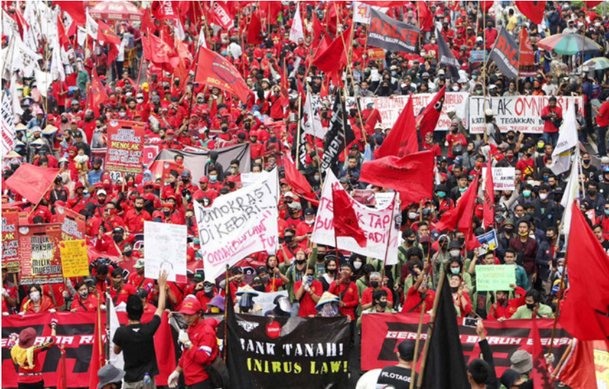
Thousands of people protest at the House of Representatives in Jakarta on July 16, 2020, to stop lawmakers from deliberating in the Omnibus Law on the Job Creation.

Members of Seruni, a national women's organization in Indonesia, are organizing women workers and farmers in palm plantations. They are also promoting agroecology in some of the rural communities they organize to challenge the dominant monocrop, export-oriented, import-dependent agricultural practice in mega-plantations.