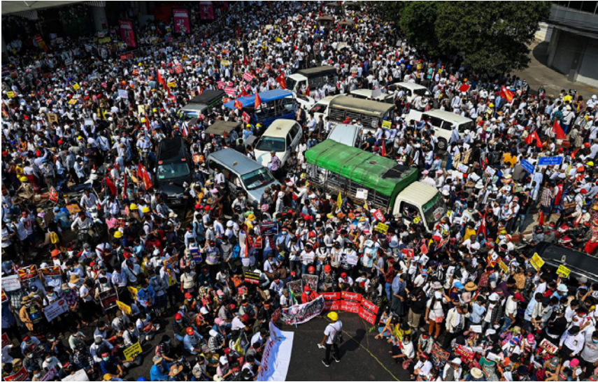
Protesters gather and wave National League for Democracy party flags as they block Yangon's roads, Myanmar against the military coup.

These protests and demonstrations in many parts of the country attest to the inevitable winds of change emanating from environmental activists and people's movements on the ground fighting for a sustainable and peaceful future. At the forefront of these struggles are ethnic groups fighting for their right to self-determination and the conservation of their ancestral lands in the face of widespread abuse, military offensives, exploitation and oppression.