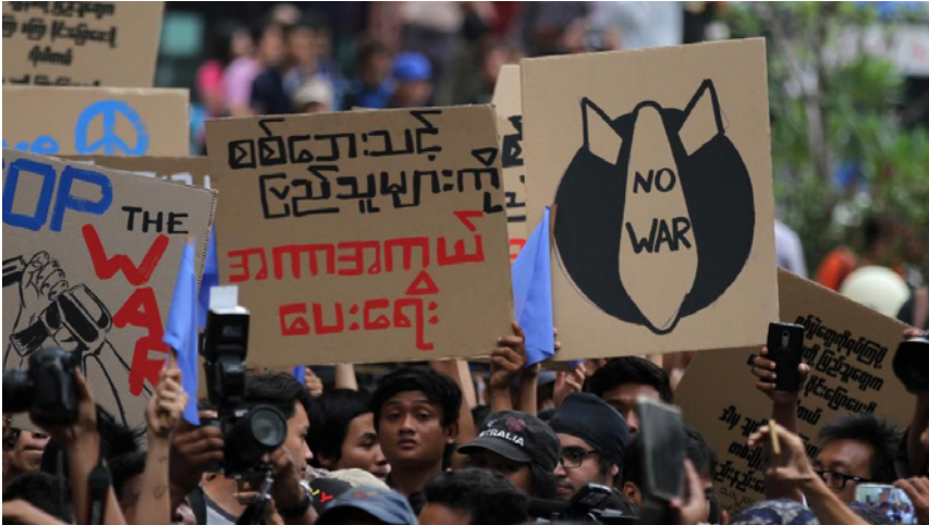
Thousands of people protest peacefully in Myitkyina to immediately call the authorities to drop the defamation charges against three Kachin Activists.

land after being forcibly seized by the government. Aung was beaten to death by a mob of about 20 people in northern Shan state. Three people were arrested for his murder but was shortly released by authorities (FIDH, 2017; Reuters, 2017).