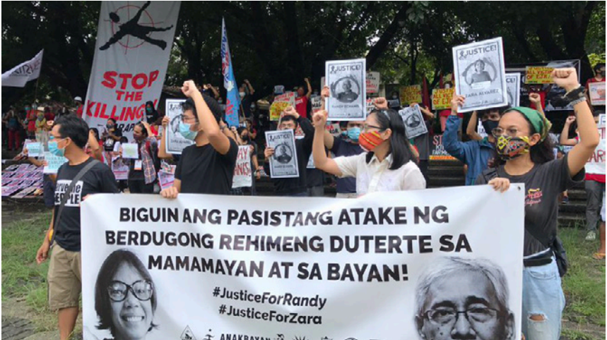
Human rights advocates held a protest in Bantayog ng Bayani as killings of defenders have risen dramatically.

Environmental defenders' rights are put into peril by the intensifying and were still a constant target of all the alarming rise in the killings, illegal arrests, online threats, red-tagging, detention, harassments, attacks, and human rights violations. Amid the pandemic and strict community lockdown, there have been 555 total victims recorded since March 15, 2020. Fifty-five killings, 53 threats and intimidation, 142 illegal arrests and detention, 58 strategic lawsuits against public participation (SLAPP), 51 political prisoners, three extrajudicial killings, 12 surveillance, and 295 forced evacuations reported.