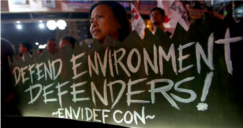
Kalikasan People's Network for the Environment protest the continued harassment of environmental defenders under the Duterte Administration.

In the province of Nueva Vizcaya, indigenous people and farmers set up a barricade in 2019 to stop the entrance of OceanaGold Philippines Inc. (OGPI) in their community. OGPI asserts its right to operate despite having an expired permit. Despite attempted dispersals, death threats, and other forms of harassment, the residents have maintained the barricade up to the present.