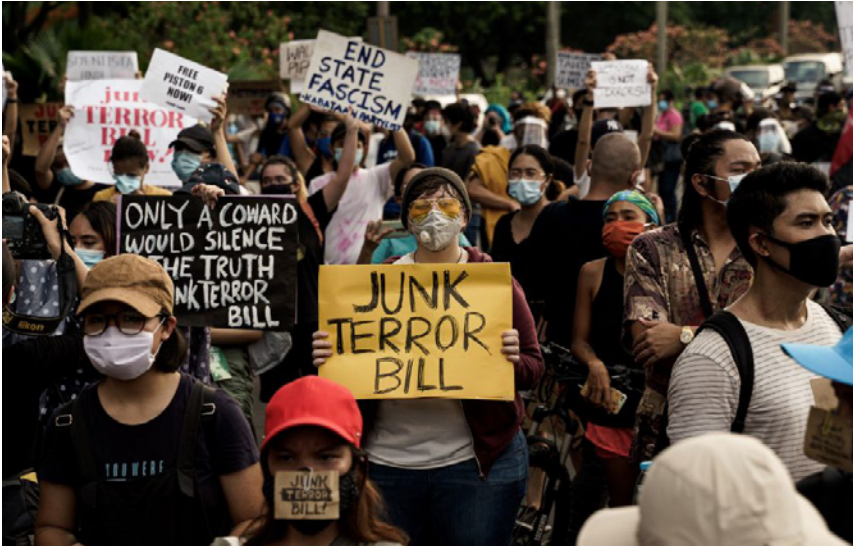
Several civil rights groups protest along University Avenue of the University of the Philippines-Diliman to oppose the Anti-Terrorism bill.

definition of terrorism can subject suspects to be arrested without a warrant and two-week detention before an appearance before a judge. According to Human Rights Watch, "the law will open the door to arbitrary arrests and long prison sentences for people or representatives of organizations that have displeased the president."