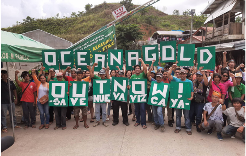
A photo from the National Solidarity Mission to the People'sPeople's Barricade against Oceanagold Mining in July 2019.