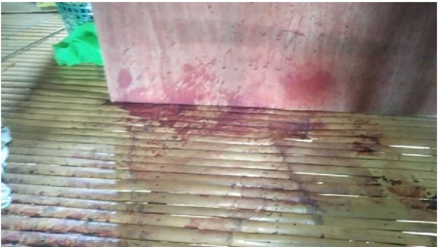
One of the village houses was spattered with blood from one victim of the massacre.

After the massacre, the 78 households of barangay Lahug or around 300 people left their homes on January 1, 2021. Residents feared they would suffer the same fate from the military. They evacuated to the town's Civic Center and were assisted by local officials and cause-oriented groups. After getting assurance from Tapaz Mayor Roberto Palomar for their safety, the beleaguered residents returned to their homes on January 7.