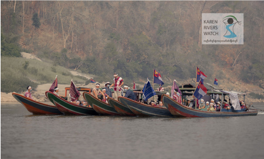
Karen peoples hold a symbolic action to defend the Salween River against mining aggressors.