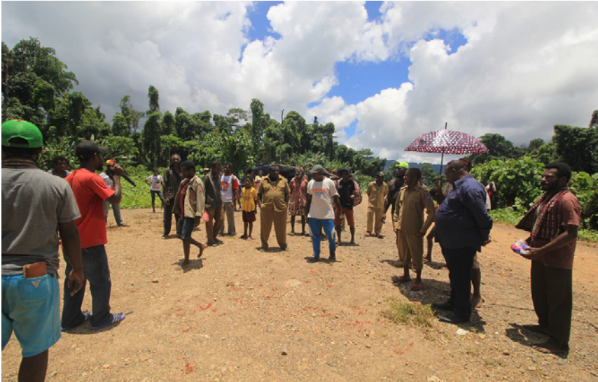
Moi Indigenous Peoples block the roads to stop the oil palm plantation in Sorong District.

end as company security guards allegedly killed two farmers in April 2020. The conflict between the company and the villagers has been ongoing since 1993, when the company forced the residents to give up their land in exchange for what they considered paltry compensation (Savitri, 2020). Activists denouncing that the company used the lull in oversight during the COVID-19 outbreak to strengthen its claims (Business and Human Rights Resource Centre, 2020).