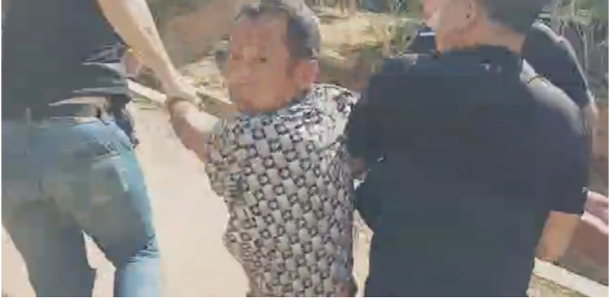
The Police forcibly took effendi Buhing.