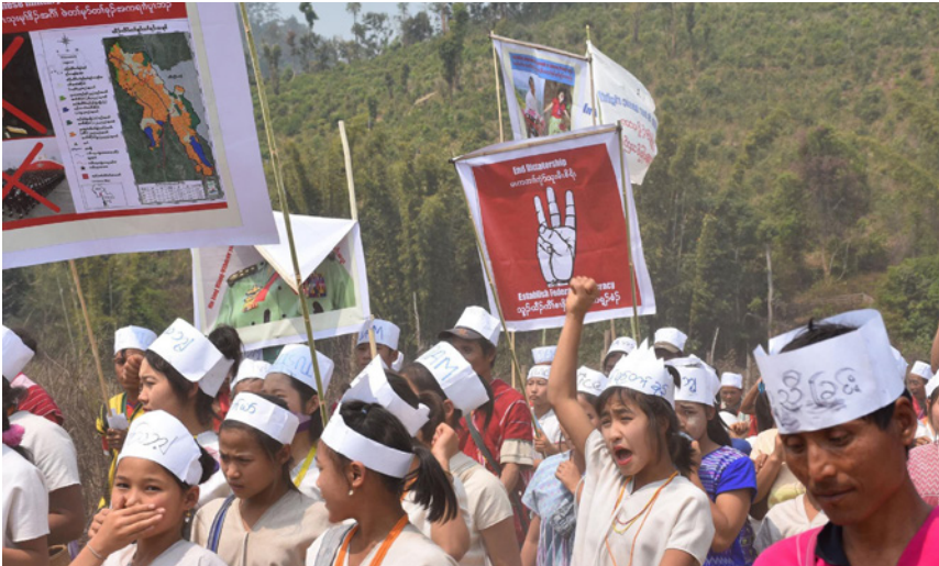
Karen villagers protest to demand environmental conservation and the right to self-determination against Salween Peace Park's military rules.

League of Democracy's (NLD) landslide victory in 2015 and the renewed hope to transition to democratic rule, the country underwent rapid structural reforms exposing its vast natural resources even further to extractive mining and logging industries. To date, the extractives sector makes up 4.8% of Myanmar's Gross Domestic Product (GDP), contributes 5.2% of total government revenues and constitutes 35% of net exports making it an indispensable base for the country's economy (EITI, 2018).