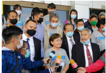
At the Civil Court for the Environmental Case on December 24, 2020, the Nam Pu subdistrict villagers in Ratchaburi province win a crucial court case against the industrial waste treatment plant, Wax Garbage Recycle Center Compan, who alleged of polluting water resources and damaging the environment and villagers’ health. (Photo and caption by Earth Thailand, Facebook)

The court ordered the three defendants to pay as compensation a total of THB 666,425.00 (USD 21,528.00) THB 508,500.00 (USD 16,426.00) and THB 135,000 (USD 4,360.00) respectively. These amounts will compound at an interest rate of 7.5% per year until the completion of payment.