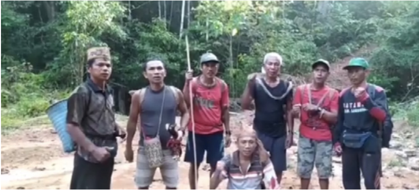
Some members of the Laman Kinipan community.