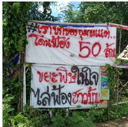
Top: we fight to protect our community, but we were sued for 50 million baht from the company. Bottom: the toxic waste is in the soul of the company who sued the people in the community

The working group’s final session scheduled on April 22, 2020 was to monitor the progress of problem-solving at the factory. However, the meeting was postponed for a month to May 22, following the Covid-19 outbreak.