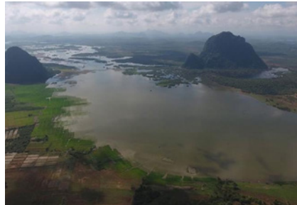
The Salween Peace Park in Karen state officially opened to the public on December 18, 2018.