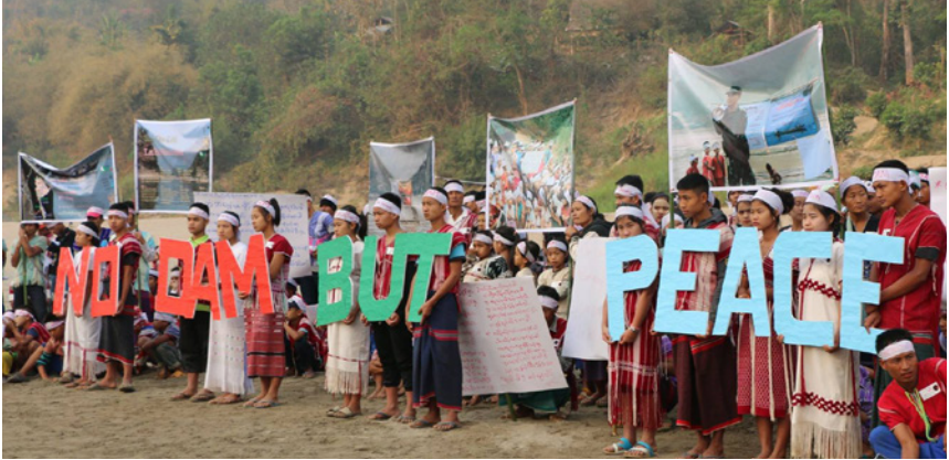
Members of the Karen River Watch stage a protest action against dams during the commemoration of the International Day of the Rivers on March 14, 2019.