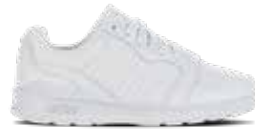
99078-998-M White/White/Vapor Blue