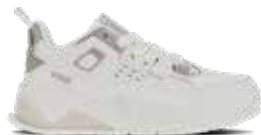
04077-942-M Sail White/Taupe Gray (7/1)

The Techna Trainer is a fresh, new 90's inspired cross trainer featuring a flat, wide outsole for stability during those intense gym workouts. The lightweight EVA midsole provides comfort and cushioning for casual wear. The multi-panel upper provides material and color mixes that gives the shoe a fresh and stylish athletic look.