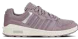
99079-051-M Purple Dove/Silver/Snow White (9/1)