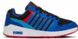
09079-049-M Black/Blue Lolite/Salsa (6/1)