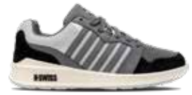
09079-055-M Smoked Peral/Lunar Rock/Blk