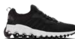
99085-035-M Black/White/Smoked Pearl