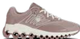
97924-204-M Fawn/Antler/Snow White (8/1)

Get out there firing on all cylinders in the new Tubes Sport. Built around our patented Tubes system, this sneaker provides unmatched cushioning and flexibility through individually tuned tube structures that collapse and rebound as you walk. Smaller, more rigid tubes on the inside area of the heel give extra medial support to reduce pronation. A lightweight mesh upper creates breathability, while the TPU stripes and mudguard ensure stability for your next adventure.