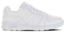
09078-998-M White/White/Vapor Blue