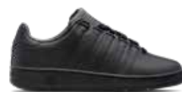
04404-001-M 04404-001-XW Black / Black