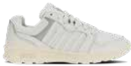
99079-160-M Blanc de Blanc/Antq White (6/1)

Our Rival Trainer is a trendy take on the traditional athletic trainer. Taking cues from our popular Si-18 Rival, the design includes a panel-layered upper, classic five stripes, and material mixes. The rubber cup sole pays homage to the legacy of K-Swiss heritage court shoes, while the sculpting details give the shoe a modern, athletic flair. Whether worn in all white or eye-catching colors, this trainer is sure to turn heads.