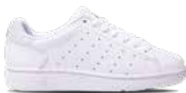
98505-101-M White / White