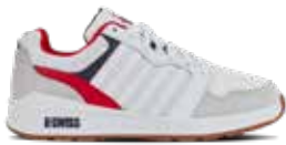
09079-162-M White/Corporate/Gum (6/1)

Our Rival Trainer is a trendy take on the traditional athletic trainer. Taking cues from our popular Si-18 Rival, the design includes a panel-layered upper, classic five stripes, and material mixes. The rubber cup sole pays homage to the legacy of K-Swiss heritage court shoes, while the sculpting details give the shoe a modern, athletic flair. Whether worn in all white or eye-catching colors, this trainer is sure to turn heads.