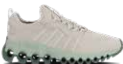
99085-258-M Oatmeal/Frosty Green/DG (7/1)