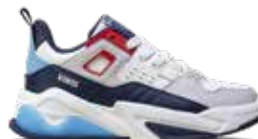
04077-936-M Sail White/Navy/Red (7/1)