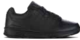
09078-029-M Black/Black/Smoked Pearl