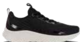
94079-008-M Black (7/1)

The Helio Trainer is a simple running inspired trainer that features an ultra-light molded EVA midsole and a breathable engineered mesh upper that provides lightweight cooling comfort and fit. Whether walking or going for a light jog, this comfort engineered trainer will keep you on your feet all day, mile after mile.