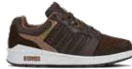
09079-227-M Chocolate Brown/Toasted Coconut (9/1)