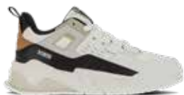
04077-938-M Sail White/Pigeon Gray/Blk (7/1)