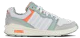
99079-199-M White/Frosty Green/Gray V. (6/1)