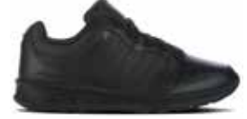
99078-029-M Black/Black/Smoked Pearl