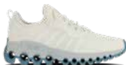
99085-167-M Star White/Pearl Blue/SL (6/1)

Introducing the Tubes Slip-on, the perfect sneaker for running out the door. Built around our patented Tubes system, the Slip-on provides unmatched cushioning and flexibility through individually tuned tube structures that collapse and rebound as you walk. Smaller, more rigid tubes on the inside area of the heel ensure extra medial support to reduce pronation. A lightweight mesh upper gives a comfy sock-like fit that's easy to slip on and off with no laces to worry about. We've given you ideal comfort and convenience all in one shoe.