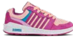
99079-806-M Peach Parfait/Festival Fuchsia (6/1)