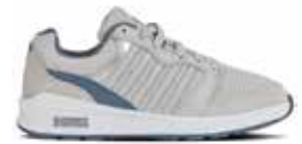
09079-091-M Gray Violet/Silver Sconce/ Flint Stone (9/1)