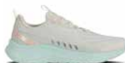
94079-932-M Sail White/Foam Green (7/1)