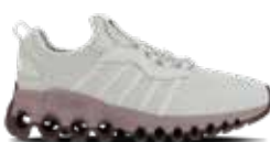
99085-028-M Dawn Blue/Purple Dove/Raisin (8/1)