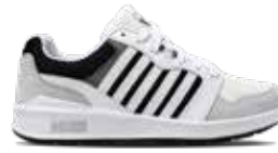
09079-920-M White/Black/Lunar Rock