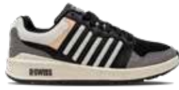
99079-067-M Black/Blanc de Blanc/Smoked Pearl