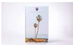
TABLE STAND WITH DOUBLE SIDED GRAPHIC INSERT