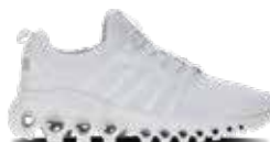
99085-911-M White/Glacier Gray