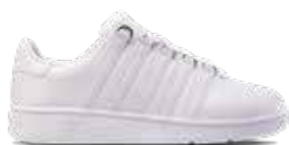
04404-101-M 04404-101-XW White / White

Our household name, the Classic VN, is the first all-leather tennis shoe. Born and based in Los Angeles in 1966, the Classic is still making waves more than 50 years later with its iconic silhouette, textured and thick molded rubber outsole, signature D-rings, five stripes, and three-piece toe. The 4th generation of the VN is modernized with more premium full-grain leather, increased comfort, and improved sustainability— with the addition of recycled PET linings and laces, in-ternal components made using recycled ocean plastics, and more eco-friendly foam materials in the sock liner and internal midsole. Born out of innovation, the Classic has evolved into a statement of timeless design, an expression of our passion for quality craftsmanship, and an enduring symbol of our authentic tennis heritage.