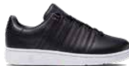
04404-002-M 04404-002-XW Black / White