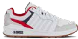
99079-143-M White/Corp/Red (6/1)