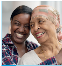
23 WOMEN'S HEALTH