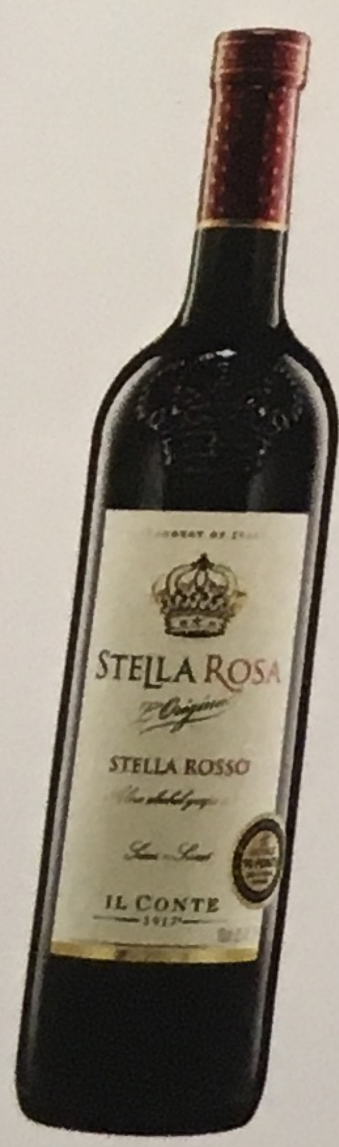
Rosso - The Original

All Stella Rosa® wines are specially crafted in Italy by sourcing the finest grapes from Italy's prestigious Piedmont region. Now with more than 20 different flavors, Stella Rosa® Originale and fully sparkling Imperiale lines offer something for everyone. Look for this crowd pleaser at your favorite retailer and visit www.stellarosa.com for more information and fun cocktail recipes!