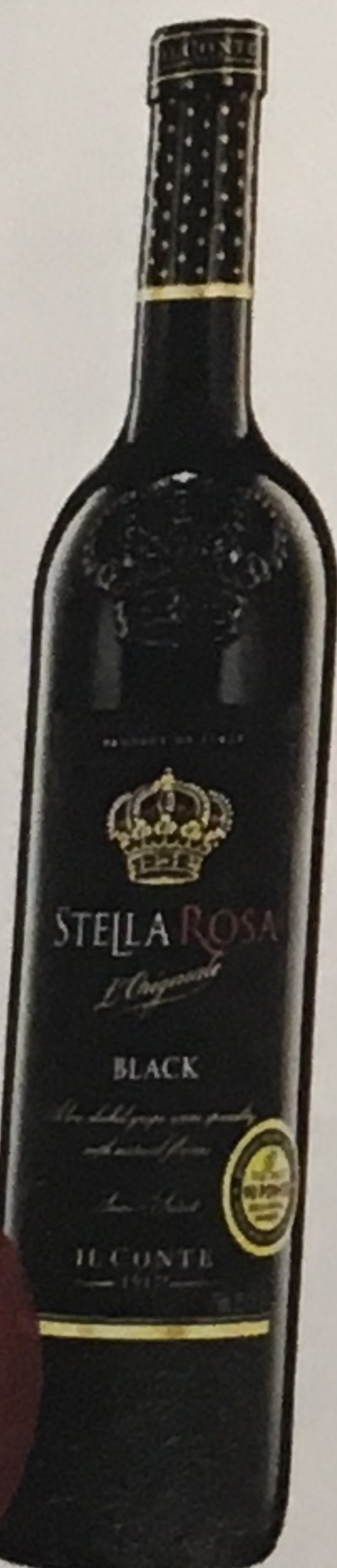
Black - Seductive & Sexy

Summer is forever where there is Stella Rosa Peach, a refreshing semi-sweet, semi-sparkling wine with white peach and honey notes that will tickle your tongue and keep your days fun. Share a bottle with friends and relish in the moments.