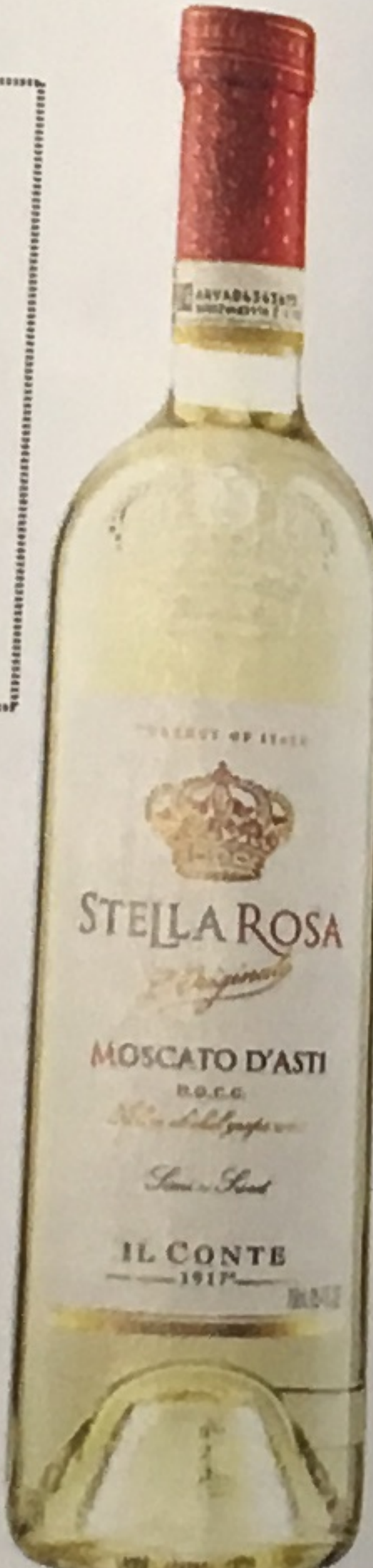
Moscato D'Asti - The Versatile One

Taste the Magic with Stella Rosa Black, a sultry semi-sweet, semi-sparkling red blend from the Luxury Collection. There's a mysterious nature about this one that is undeniably alluring with its luscious flavors of blackberry, blueberry, and raspberry.