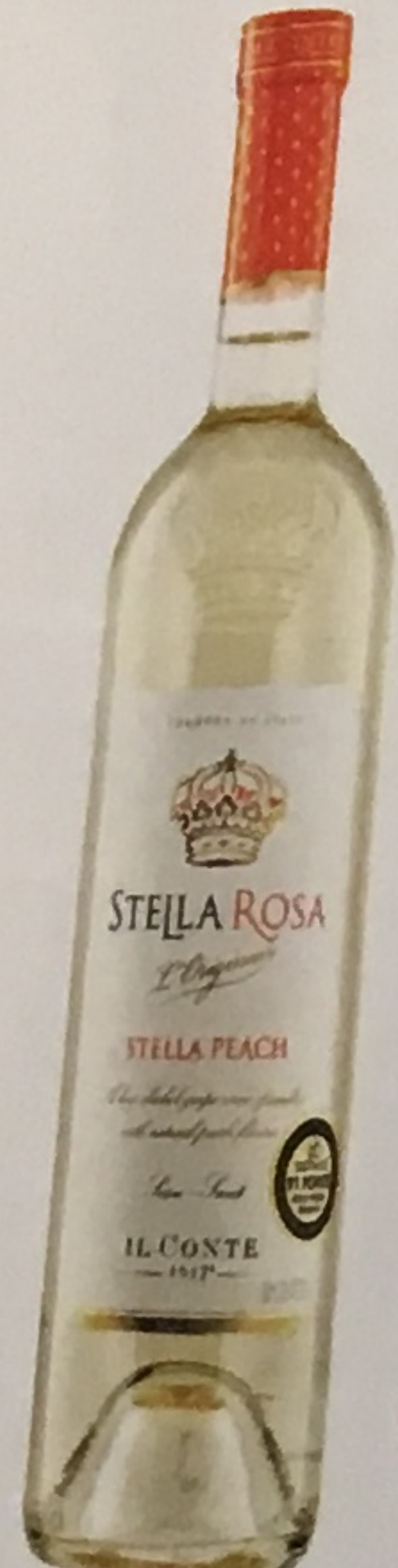
Peach - Summer in a Bottle

Stella Rosa Rosso, the timeless original Stella, is all about the classics. This semi-sweet, semi-sparkling red wine is the must-have at every occasion, bursting with delicious strawberry and red berry flavors.