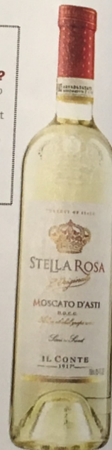
Moscato D'Asti - The Versatile One

Taste the Magic with Stella Rosa Black, a sultry semi-sweet, semi-sparkling red blend from the Luxury Collection. There's a mysterious nature about this one that is undeniably alluring with its luscious flavors of blackberry, blueberry, and raspberry.