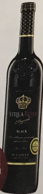
Black - Seductive & Sexy

Summer is forever where there is Stella Rosa Peach, a refreshing semi-sweet, semi-sparkling wine with white peach and honey notes that will tickle your tongue and keep your days fun. Share a bottle with friends and relish in the moments.