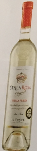
Peach - Summer in a Bottle

Stella Rosa Rosso, the timeless original Stella, is all about the classics. This semi-sweet, semi-sparkling red wine is the must-have at every occasion, bursting with delicious strawberry and red berry flavors.