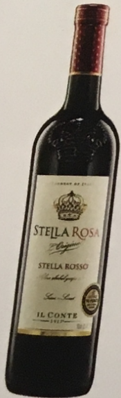
Rosso - The Original

All Stella Rosa® wines are specially crafted in Italy by sourcing the finest grapes from Italy's prestigious Piedmont region. Now with more than 20 different flavors, Stella Rosa® Originale and fully sparkling Imperiale lines offer something for everyone. Look for this crowd pleaser at your favorite retailer and visit www.stellarosa.com for more information and fun cocktail recipes!