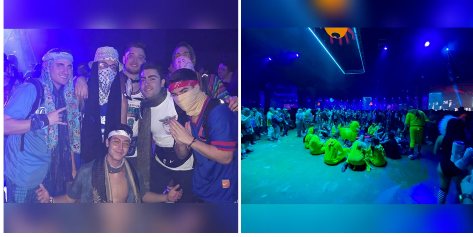
GRIZ and Subtronics At Hijinx Night 1

Hijinx only has one stage, and it's a pretty badass one. There are several screens on both sides, electronic panels lining the ceiling, inflatable monsters, and a killer laser production. Adding in all the other wonky decorations it wasn't short of being inside of a Rick and Morty episode. It was time to get schwiifty. The venue's staff was also extremely helpful and provided over 6 water stations. Not having to wait in line to fill up your camelback during a set makes a happy headbanger.