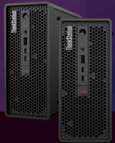
ThinkStation® P360 Ultra Workstation