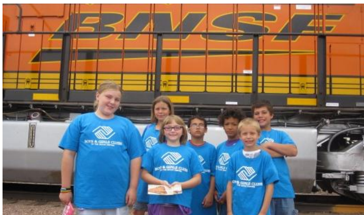
Youth and family members from YES and the Eastside Boys & Girls Club boarded passenger cars on June 10 for a ride on the BNSF Railway Special. Volunteer leaders, donors and other friends of BGCSE lunched aboard the train during a three-hour round trip.

Guests of the Club and Youth Enrichment Services programs departed from the BNSF Downtown Depot and rode in style: inside one of 15 restored vintage railcars from the 1950s-1960s, powered by two of BNSF's newest locomotives.