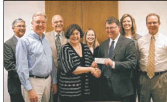
Leaders at Bethany Lutheran Foundation, which supports the work of nursing-home and assisted-living facilities in Sioux Falls and Brandon, visited SFACF to present the establishing gift for their agency's new endowment.

The upcoming City Blossom will be held Thursday, April 29, 2010, in the courtyard at the new Sammons Financial Group building.