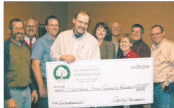
Organizers of the Hartford Area Community Foundation secured a $10,000 challenge grant from SFACF to leverage dollars they raised from individual donors and through a match from their home town development foundation.