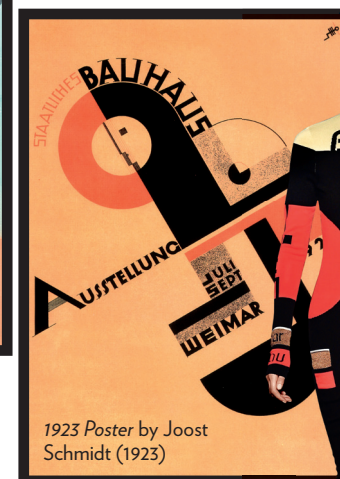
1923 Poster by Joost Schmidt (1923)

Longevial's cubist portraits of feminine fixtures create the base of the season's colour palette: various hues of pink. These were mixed with ivory, camel, canary yellow, chalk blue and navy blue.