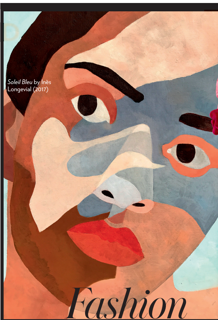
Soleil Bleu by Inès Longevial (2017)