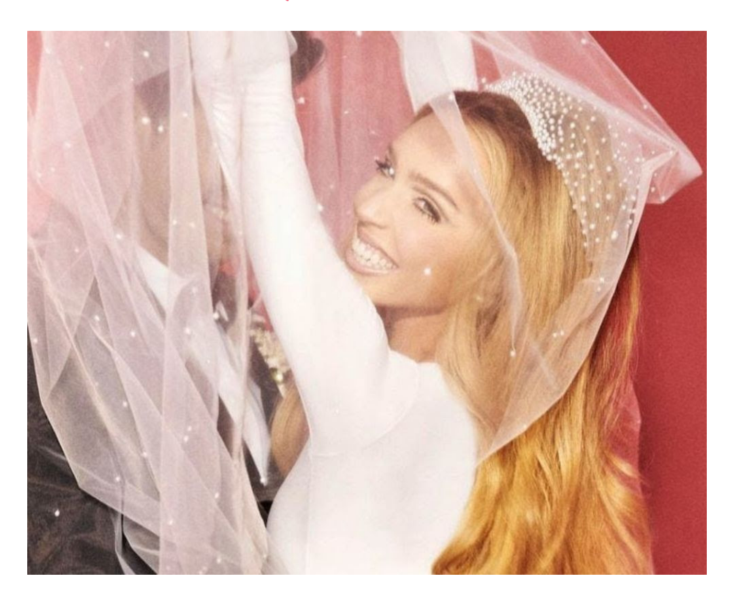
SKIMS' wedding collection is EVERYTHING