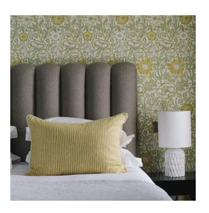
UK restaurants with rooms for a foodie honeymoon

Save money (and the planet!) with bespoke digital wedding invitations using these easy-to-use tools.