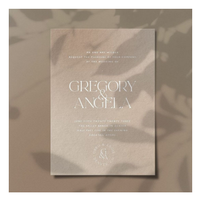
Our ultimate guide to digital wedding invitations

Save money (and the planet!) with bespoke digital wedding invitations using these easy-to-use tools.