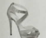
Kiss those sandals in light breeze and show to every male.