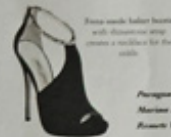
These made ladies beam with pleasure and grace in the sun.

Paragon NY 21 34 6733 9880 Marine Bay South 681 319 34 6434 8227 Raffles World Centre 612 122 34 6722 8027