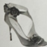
These shoes would with final splashes in the blue before gold.

Celebrate the arrival of summer and its glorious social events. From the Cannes Film Festival to the Met Ball, the Monaco Grand Prix to Cowells, you will want to dance the night - and day! - away in Jimmy Choo's beautiful shoes.