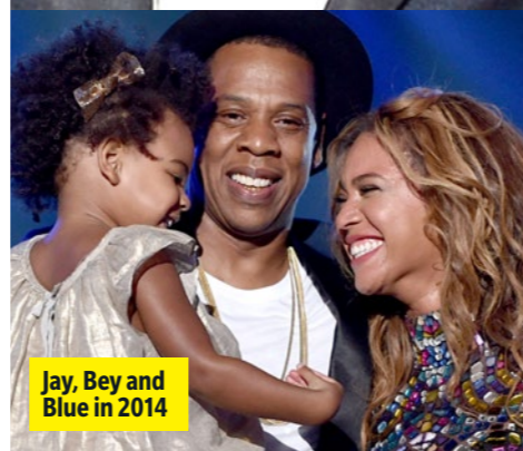
Jay, Bey and Blue in 2014

Grammy wins and PDAs soon saw them become a global power couple. But in 2006, it looked as though Jay and Bey had hit a rocky path when Beyoncé released her 2006 single Ring The Alarm , which talked about a woman feeling threatened. Rumours began swirling that the track was about Jay's alleged tryst with Barbadian singer Rihanna, who released her first album with Def Jam – the label Jay Z was president of – that year. However, Bey's father and manager at the time, Matthew Knowles, denied the claims.