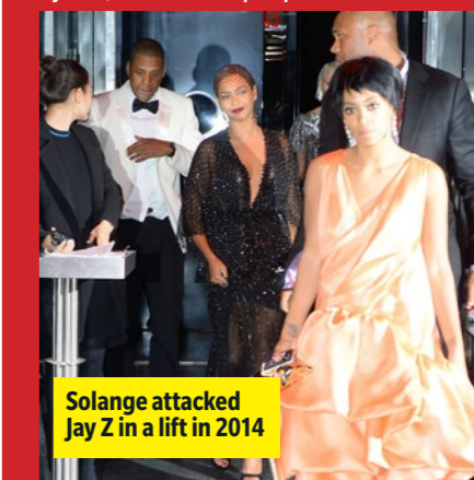
Solange attacked Jay Z in a lift in 2014

2011 Beyoncé announces she's expecting her first baby at the MTV VMAs. 2012 Blue Ivy is born on January 7. 2013 Beyoncé opens up about her 2011 miscarriage. 2014 Video footage surfaces of Solange attacking Jay in a lift. 2015 J Randy Taraborrelli's book, Becoming Beyoncé , claims the couple split in 2005.