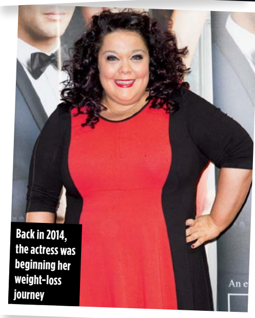
Back in 2014, the actress was beginning her weight-loss journey