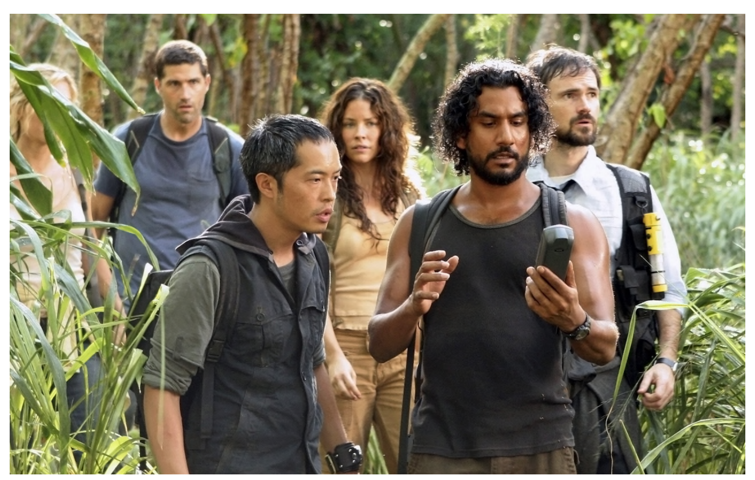
A scene from the 'Lost' television series

Survival training is one of the many skills in cabin crew's toolkit. We know how to create a shelter, gather food, find safe drinking water and attract help in the Arctic, jungle, rainforests and deserts, which means you really are safe in our hands.