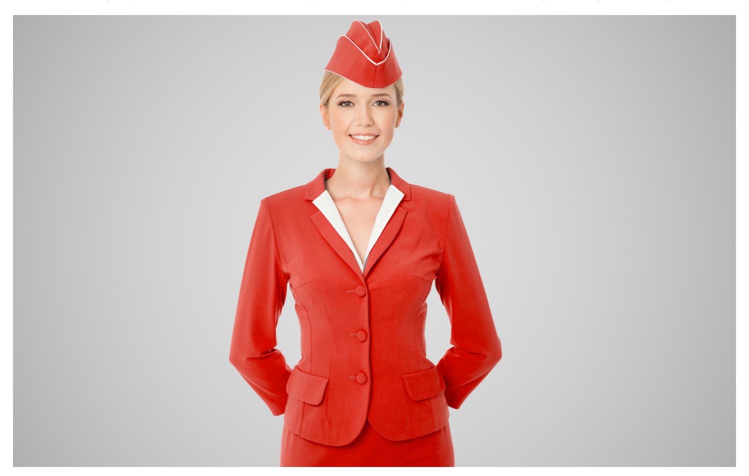
Air hostesses must abide by strict appearance guidelines

Once you're issued with a uniform, that's it - you can't change it for a size bigger if you find you've put on a few pounds. The airline will give you one month to lose the weight - otherwise you will be put on a weight management programme.