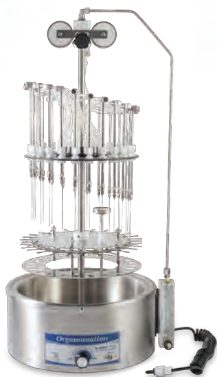
24 Position N-EVAP Catalog #11250

One of the most popular nitrogen evaporators in the market today, the N-EVAP continues to be Organomation's best selling product line. Each N-EVAP is able to process different size sample vials at once, which is an invaluable feature in environments where large batches of identical samples are not the norm. Additionally, the needle valve at each position allows for individualized control of gas flow to each sample. By providing chemists with full control of their evaporation process, in combination with an easy to use design and durable construction, it is no wonder the N-EVAP has become a mainstay in laboratories worldwide.