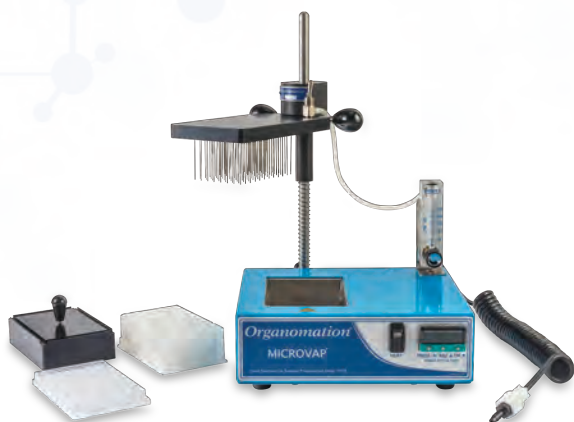
96 Position MICROVAP Catalog #11801

The MICROVAP is an ideal choice for labs looking for a low cost evaporator for microplates and small batches of tube samples. At around 7 kg and under 30 cm across, the MICROVAP is easy to move as needed to make the most of valuable hood space. Like with our MULTIVAPs, all heat blocks are expertly machined to match the user's sample tube dimensions. Versions are available without a heat source for evaporations performed at room temperature.