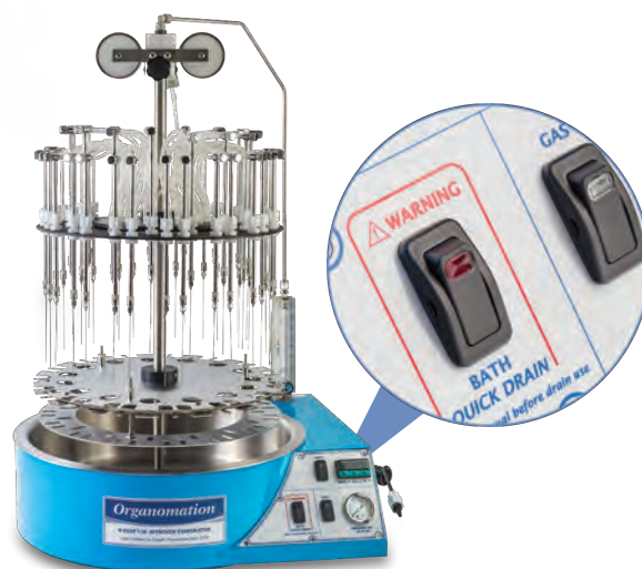
45 Position N-EVAP Catalog #11645