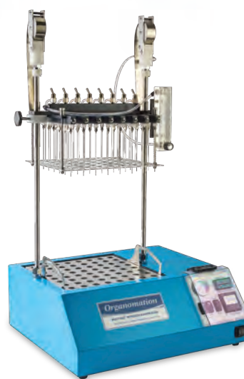
64 Position MULTIVAP Catalog #11364