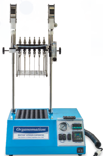
48 Position MULTIVAP Catalog #11848

From a dry block evaporator designed for nine 50 mL beakers to a water bath designed for up to 100 small volume samples, the MULTIVAP product line is a perfect match for labs needing to gently and efficiently concentrate batches of similar samples. An array of needles or glass pipettes delivers nitrogen gas directly to the surface of the sample, speeding evaporation. Simply load your samples, lower the manifold, and let the evaporation begin.