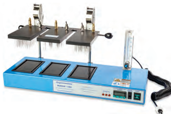
Triple Position MICROVAP Catalog #11803