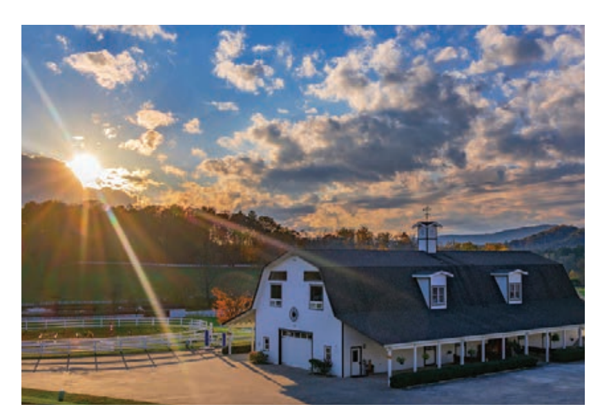
FOR A FULL LIST OF AMENITIES, VISIT TOWNCAROLINA.COM

155 Horse Shoe Farm Dr, Hendersonville, NC. (828) 393-3034, thehorseshoefarm.com