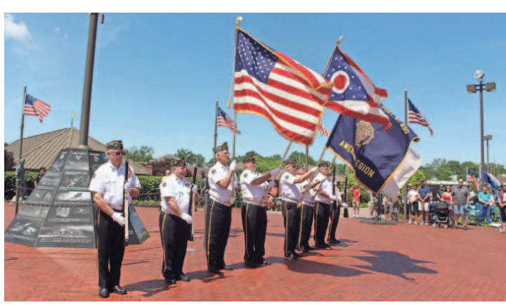
The Memorial Day Ceremony in the City of Blue Ash in 2017.