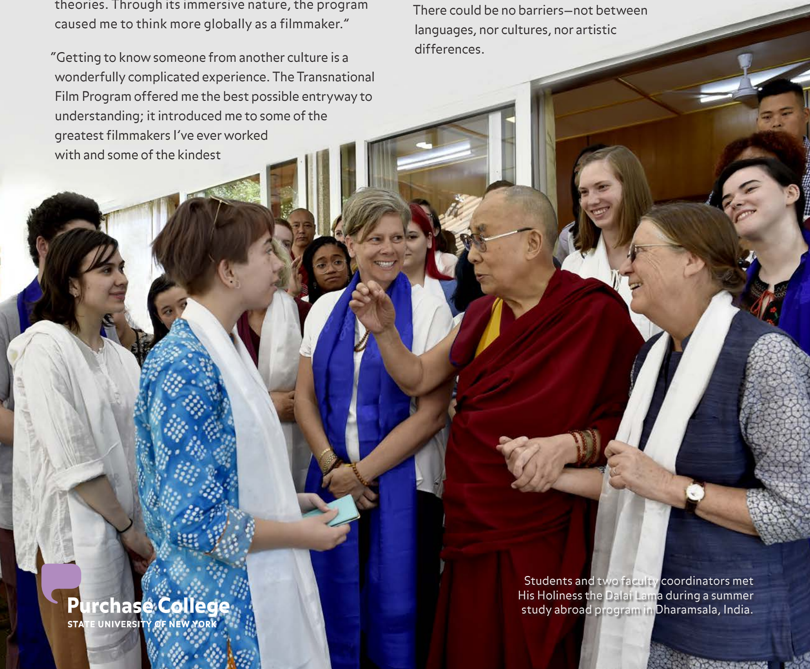
Students and two faculty coordinators met His Holiness the Dalai Lama during a summer study abroad program in Dharamsala, India.

friends I'll ever have. The Transnational program allows for cultural exchange through an artistic lens. Rather than one culture learning about another, each individual had the space to share their experiences and juxtapose them freely against others. This process was enhanced by our task at hand: to create a film. Immediately, we understood that we had to work as a team both emotionally and creatively. There could be no barriers—not between languages, nor cultures, nor artistic differences.