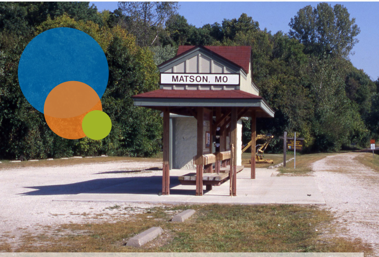
The Katy trail is a former railroad line and is now popular with cyclists.