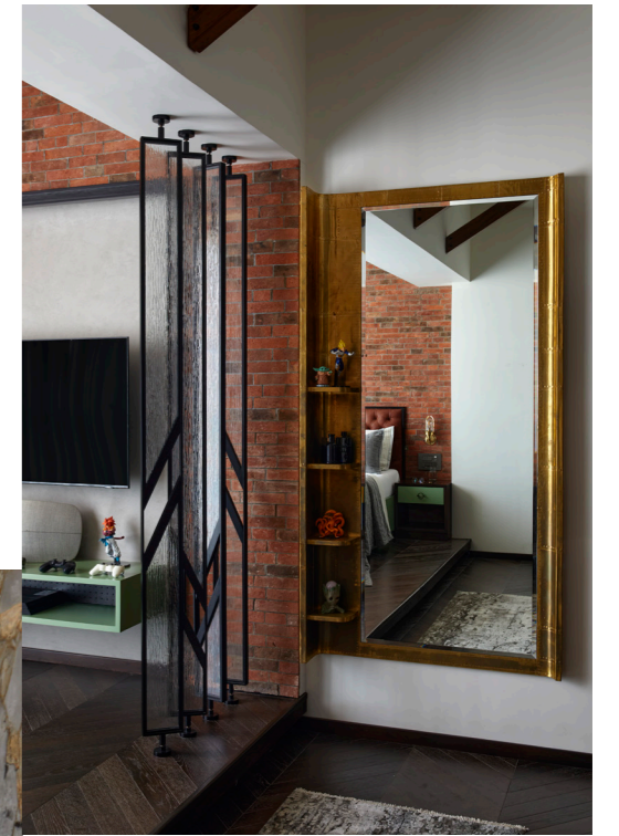
FROM TOP A quirky spin on an NYC loft, the son's bedroom stars exposed brick tiles from Bombay Tiles and wooden flooring from Havwoods. In the reflection of the mirror by Rasika Garware, you can spot a carpet by Cocoon Fine Rugs; A haven of Versace Gold marble from Elegant Marbles, the primary bathroom is illuminated by ceiling light from FLUA and the Litolier wall sconces above the vanity. Flanked with a wardrobe from Jap Modular Furniture, the bathroom displays gold bath fittings from Kohler while the mirror is designed by Baldiwala Edge; The foyer features chairs with brass arms from Kerf Furniture and the EDIDA winning Scuba table by Nama Home. The main door was cast in brass by Rasika Gaware while Bombay Paints stepped in to give the storage rack a metallic sheen. The aluminium wall carpet, christened 'Binded', is by artist Richa Arya. The floor resembles piano keys with Italian marble tiles from Elegant Marbles