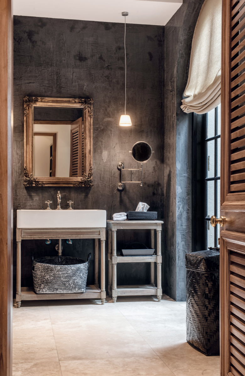
FROM LEFT Dark plaster walls cocoon the ground floor guest bathroom, providing a calming, nesting effect. The vanity and side tables are by RH, while the mirror is from Paradise Road. The pendant is Flos's Romeo Babe, sourced from Photonics; Polished plaster walls are contrasted with limestone, grounded by a honed and filled travertine floor in the guest bathroom on the first floor. The butler's tray is from Paradise Road. The painting is the work of H. A. Karunaratne, from the Sangakkaras' private collection FACING PAGE Tones of black and white play hide-and-seek in the guest bedroom. The bed and lamps are RH finds. Of particular note are the soft furnishings, custom-made using handwoven fabric sourced from Laos with custom batik by Sonali Dharmawardena. The artwork is by Bandu Manamperi