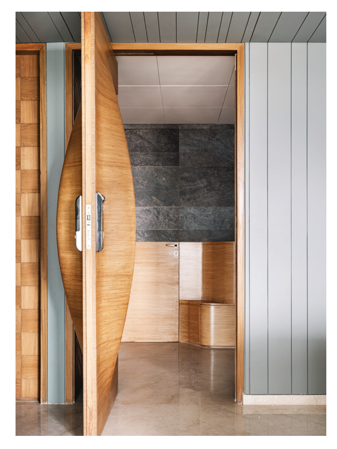
Is it an installation? Is it a wall? No, just the front door designed like a larger-than-life sculpture

The metallic see-through partition demarcating the living and dining areas is of particular note. It channels a gilded cage, a curious antithesis to the chandelier above the dining table, which evokes a free bird in flight. With spaces that contrast yet complement, echo one another yet hold their own, this home is a sum of many beautiful parts. ♦ andblackstudio.com