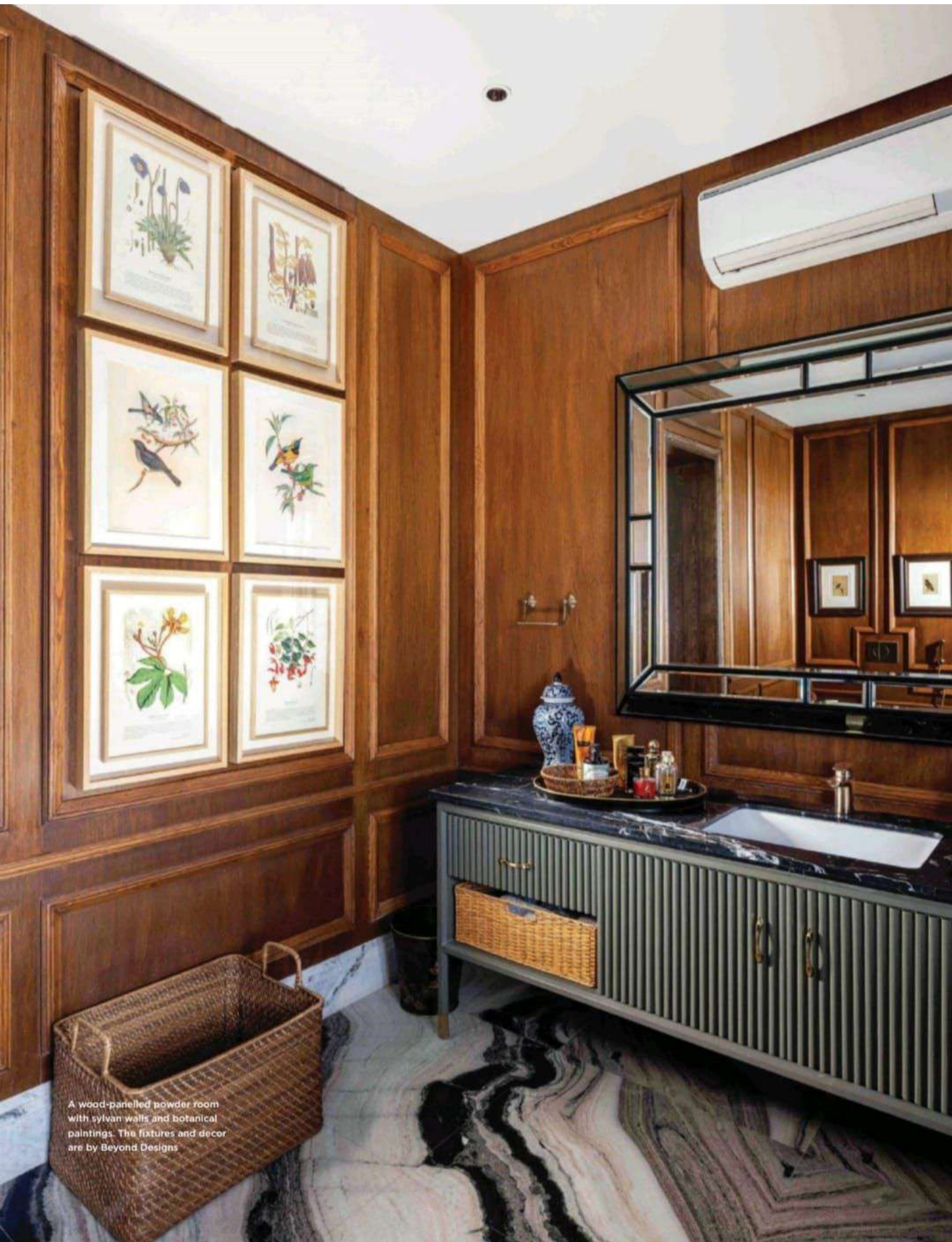
A wood-paneled powder room with sylvan walls and botanical paintings. The fixtures and decor are by Beyond Designs