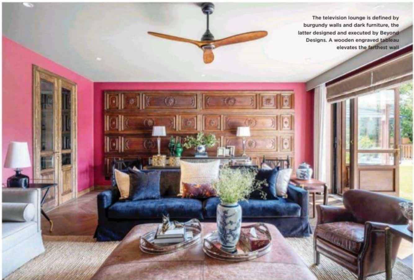
The television lounge is defined by burgundy walls and dark furniture, the latter designed and executed by Beyond Designs. A wooden engraved tableau elevates the farthest wall