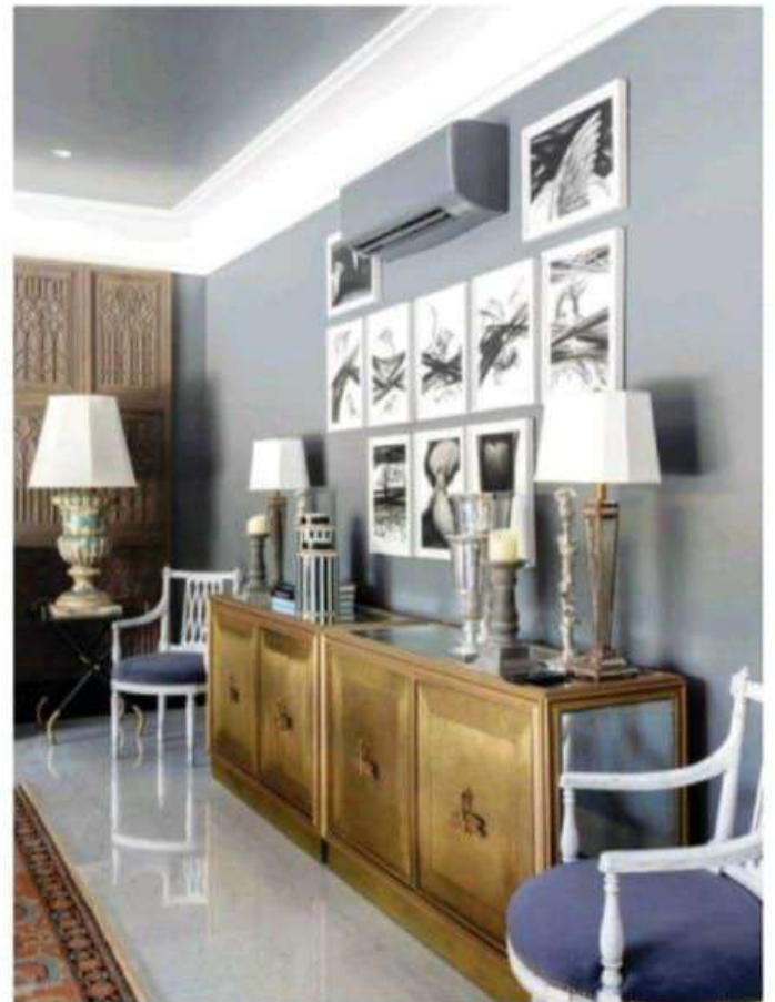
From left: In the library a petite seating nook makes for the perfect sunset perch; Another corner of the dining room, where black-and-white bird artworks, picked up by the owners on their travels, preside the wall. The sideboard is a Beyond Designs creation