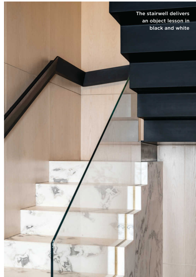
The stairwell delivers an object lesson in black and white