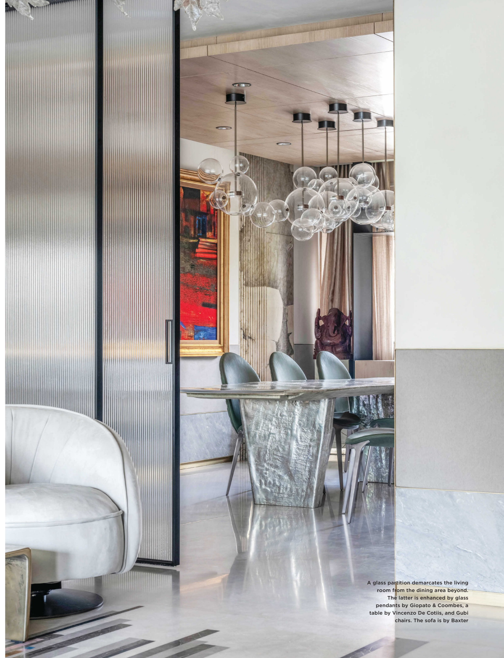
A glass partition demarcates the living room from the dining area beyond. The latter is enhanced by glass pendants by Giopato & Coombes, a table by Vincenzo De Cotiis, and Gubi chairs. The sofa is by Baxter