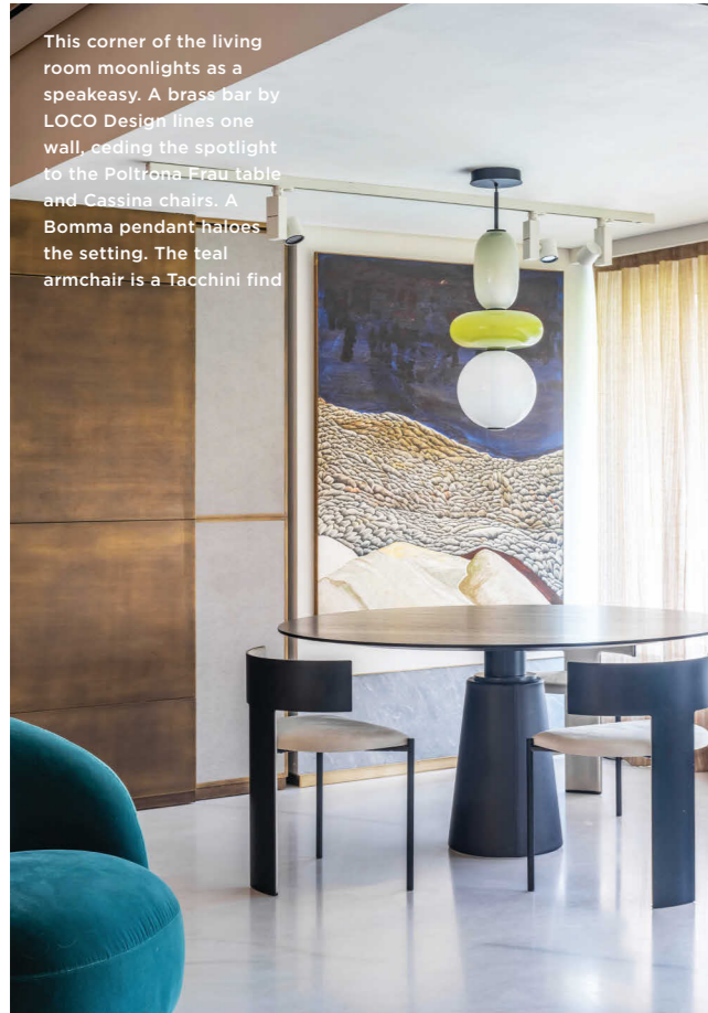
This corner of the living room moonlights as a speakeasy. A brass bar by LOCO Design lines one wall, ceding the spotlight to the Poltrona Frau table and Cassina chairs. A Bomma pendant haloes the setting. The teal armchair is a Tacchini find