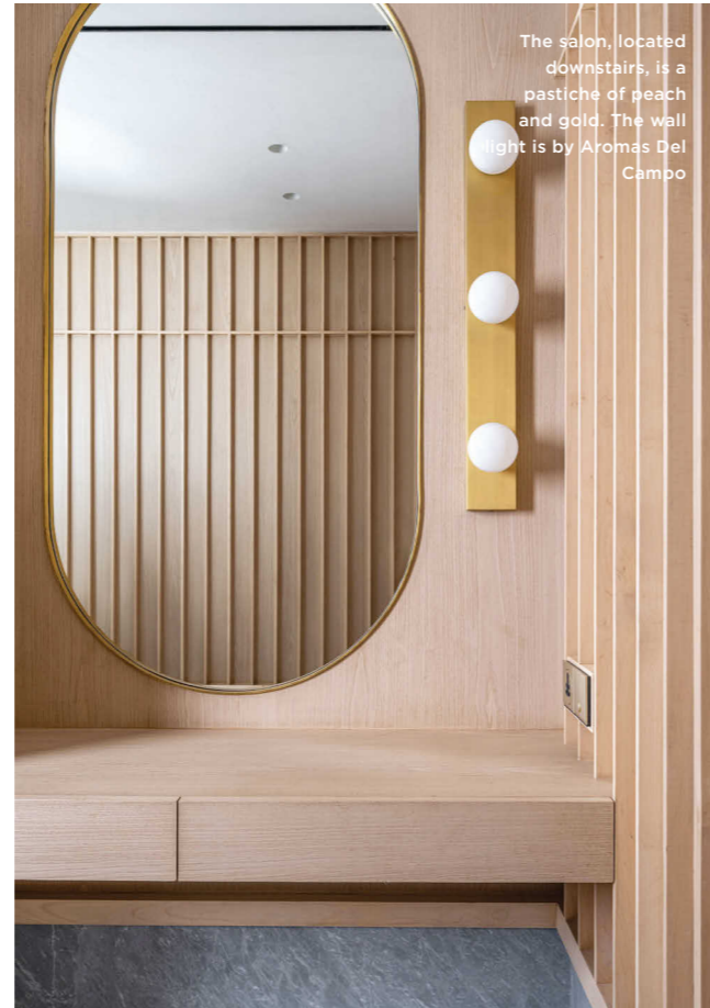
The salon, located downstairs, is a pastiche of peach and gold. The wall light is by Aromas Del Campo