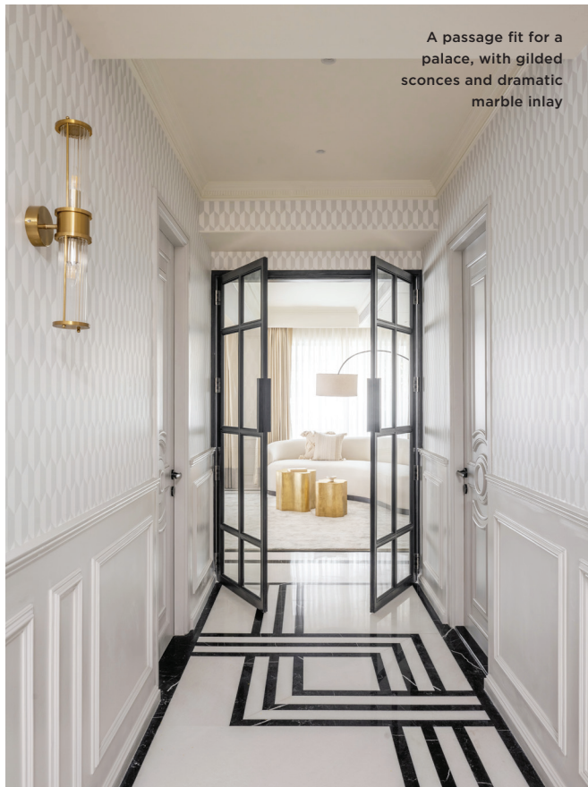
A passage fit for a palace, with gilded sconces and dramatic marble inlay