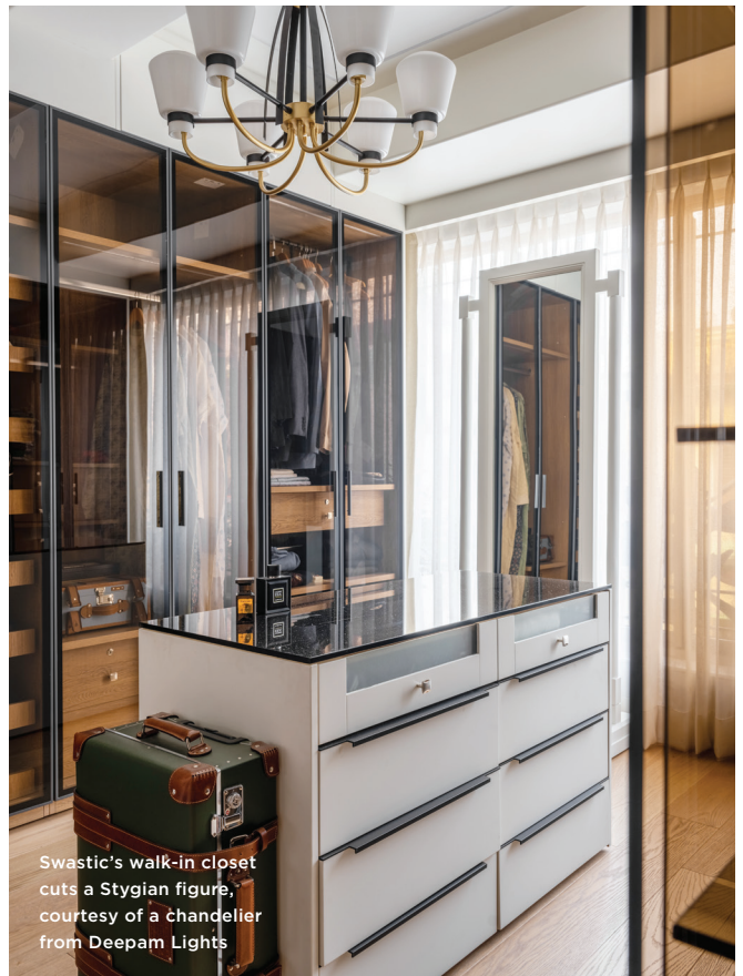
Swastic's walk-in closet cuts a Stygian figure, courtesy of a chandelier from Deepam Lights