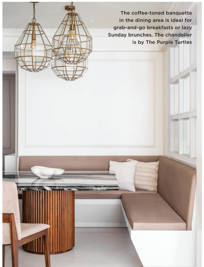
The coffee-toned banquette in the dining area is ideal for grab-and-go breakfasts or lazy Sunday brunches. The chandelier is by The Purple Turtles