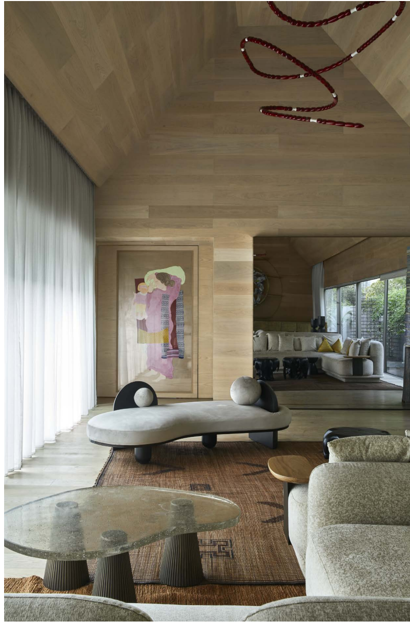
The home's gazebo houses a spacious lounge, where cosy sofas are paired with striking pieces such as an artwork by Prabhakar Pachpute, a pair of wooden bark stools from Kochi, a Tuareg rug and the Channapatna light from Atelier Ashiesh Shah