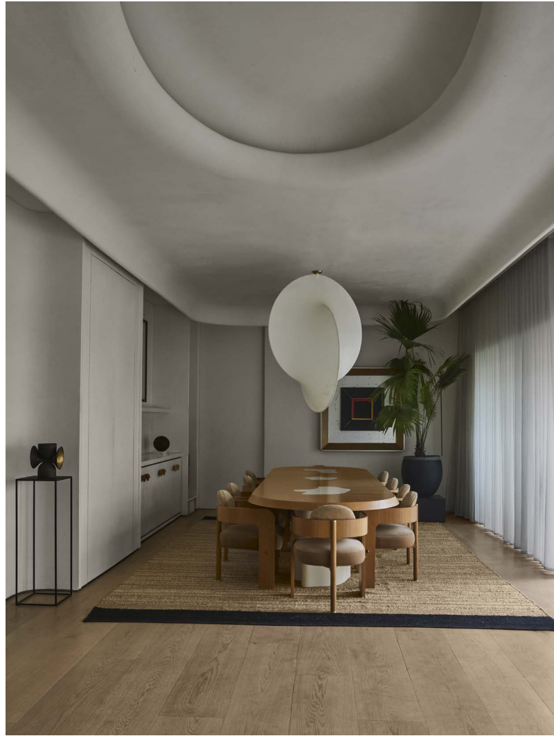
Echoing the ceiling's round moulded design, the dining room exudes a sense of elegance and softness embodied by the generous curves of the DeMuro Das dining console, table and chairs and the Flos Overlap Suspension 1 pendant by Michael Anastassiades