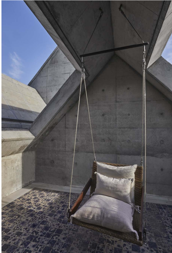
Several outdoor decks complement the indoor spaces, including a private deck adjacent to one of the girls' bedrooms with a swing by Rishi Bathla, and the massage room deck with an outdoor pouffe and an artwork by Arunkumar HG