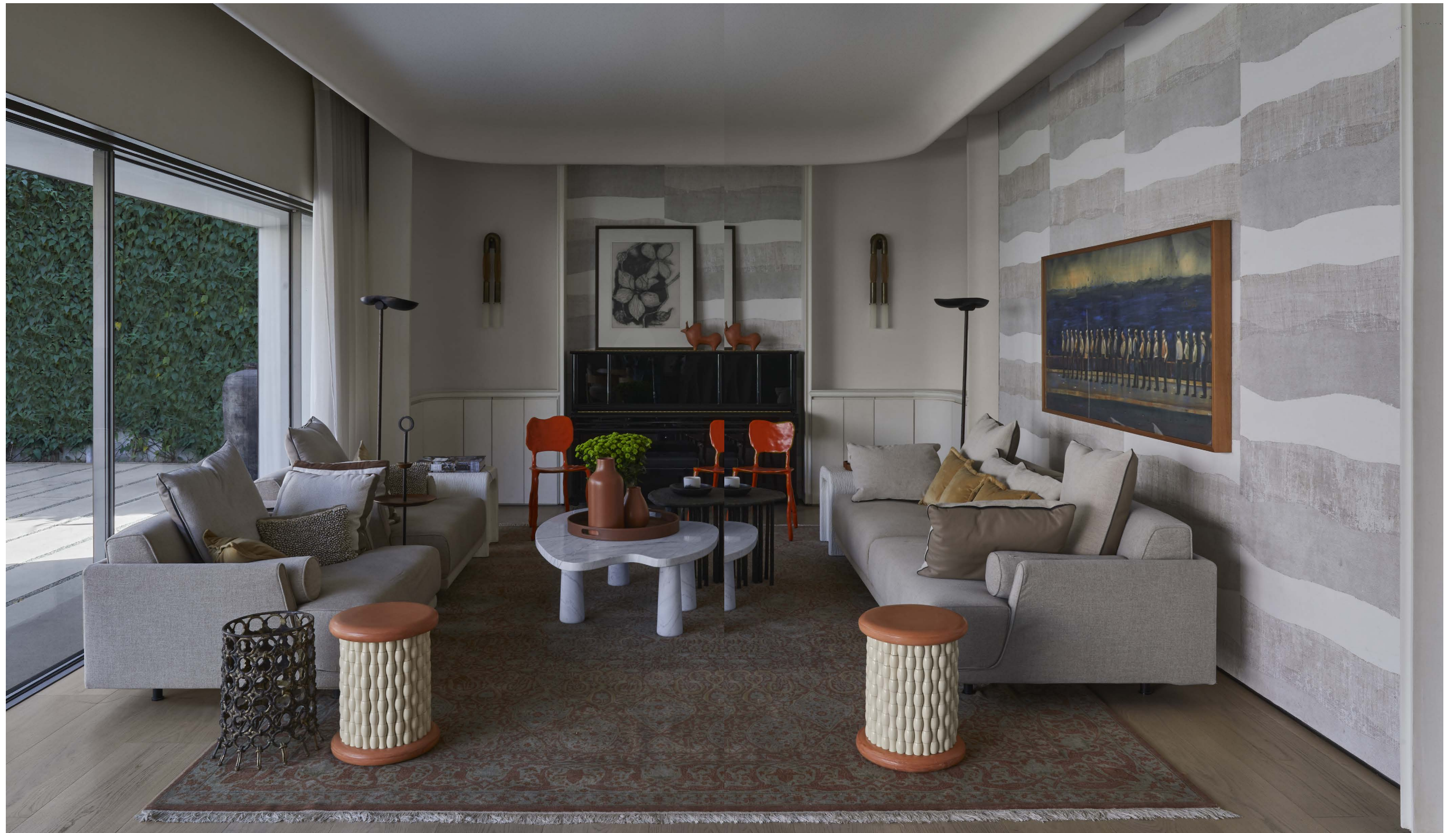
In the dining lounge, a comfortable seating area pairs the Maharaja sofa and armchairs from Giorgetti with a mix and match of pieces, including a couple of Channapatna stools from Atelier Ashiesh Shah, Clay dining chairs by Maarten Baas and various artworks by local artists