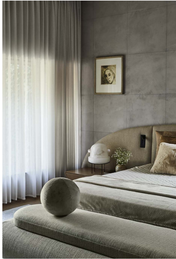
The main bedroom draws on curved elements, soft fabrics and textured paint to create a sense of comfort and respite, while the Seepi 1 ceiling lights by Shailesh Rajput Studio make a graceful statement