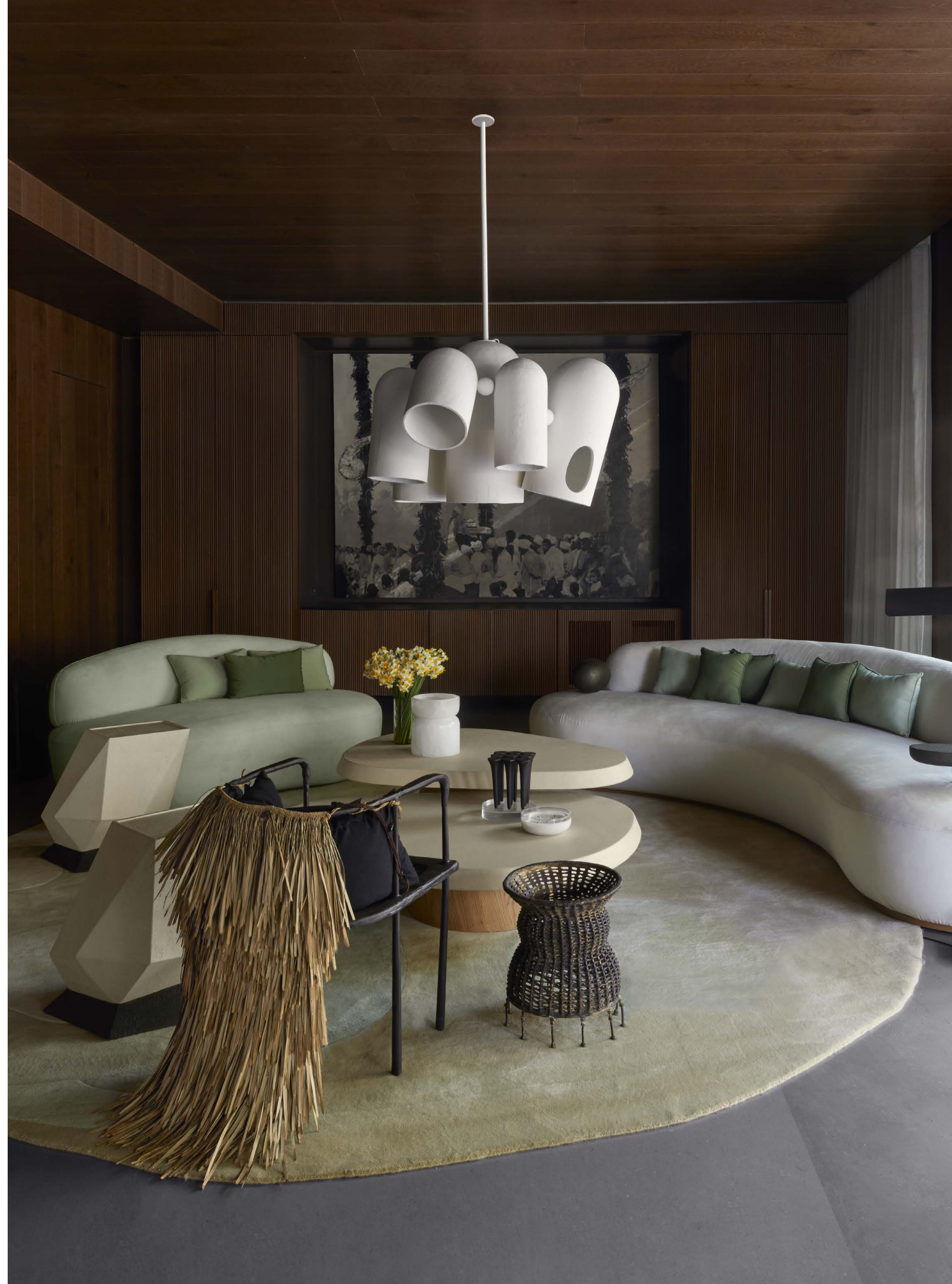
Facing page Bold contrasts define the living room, where curved sofas and the Gucca ceiling lamp from Atelier Ashiesh Shah pop against wooden walls and ceilings