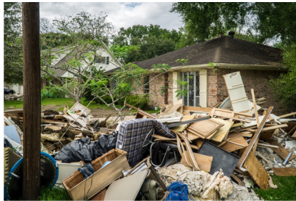
700,000 homes impacted Hurricane Florence in the Carolinas

HELPING PEOPLE REBUILD THEIR HOMES AND THEIR LIVES