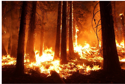
15,000 homes lost Camp Fire in Northern California