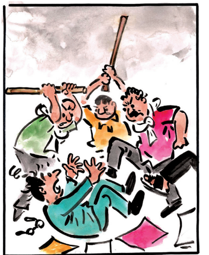
Wait a minute. Are you beating me because I've taken some decision or because I'm not taking some decision??