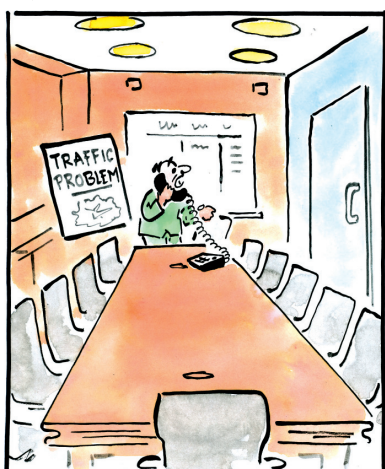
No one is here for this meeting to discuss the traffic problem... I think they're all stuck in traffic jam!