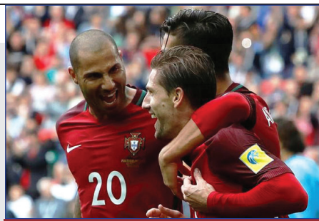
CONFEDERATION CUP: PORTUGAL BEAT MEXICO.