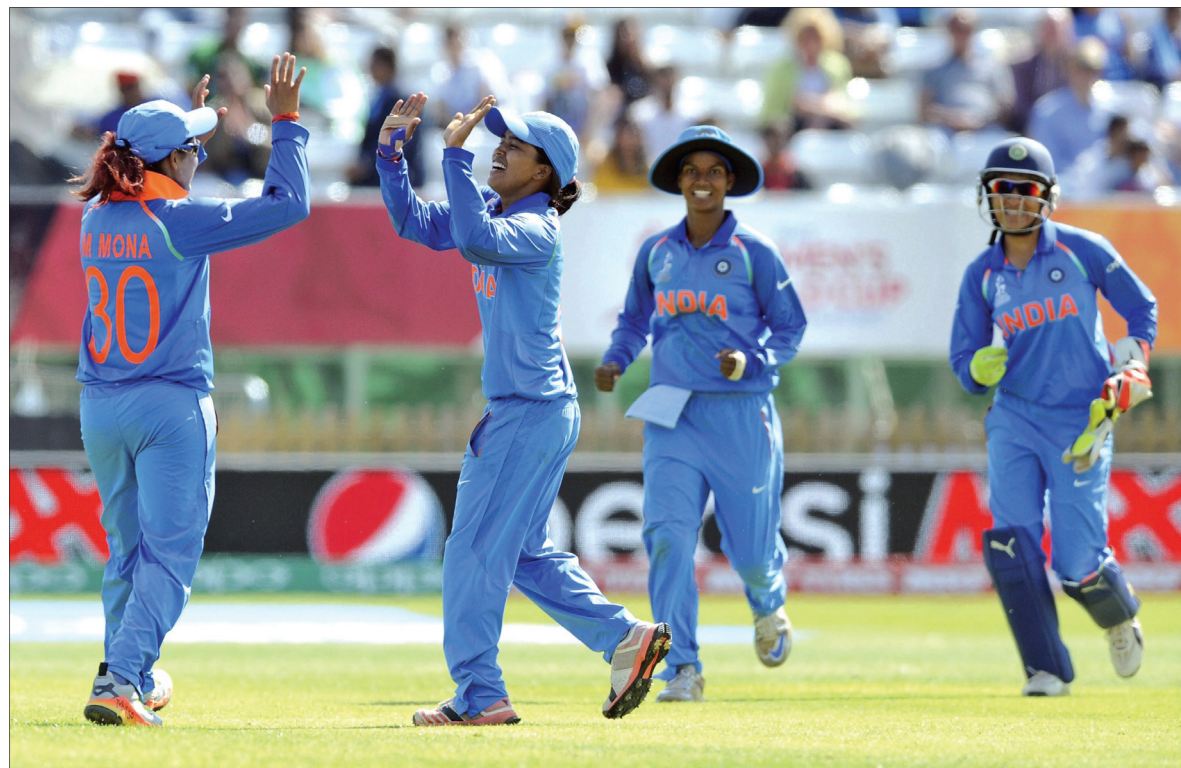
India's Ekta Bisht, (2nd from L) celebrates with teammates after dismissing Pakistan's Diana Baig during the ICC Women's World Cup 2017 match at County ground in Derby, England, on Sunday. India defeated Pakistan by 95 runs. Report on Pg 10