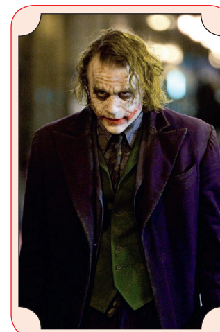
↑ | HEATH LEDGER

Quotable quip "Without Batman, crime has no punchline."