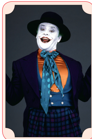
↑ | JACK NICHOLSON

Quotable quip "A joke a day keeps the gloom away!"