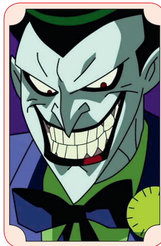
↑ | MARK HAMILL

Quotable quip "Wait until they get a load of me..."