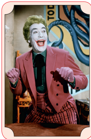
↑ | CESAR ROMERO

For every Batman, there must be an incarnation of The Joker. But who played his anarchic arch-enemy the best?