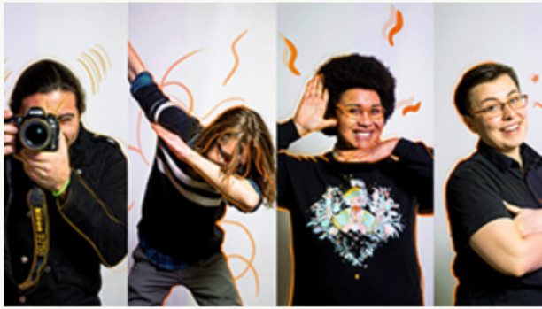
An Unforgettable Game Studio Senior Show