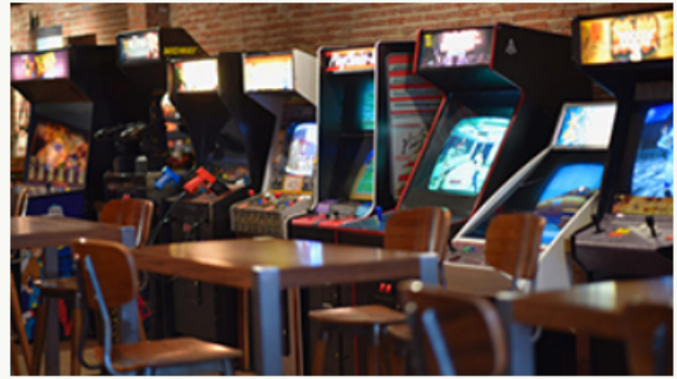
Top 5 Burlington Spots for Gamers