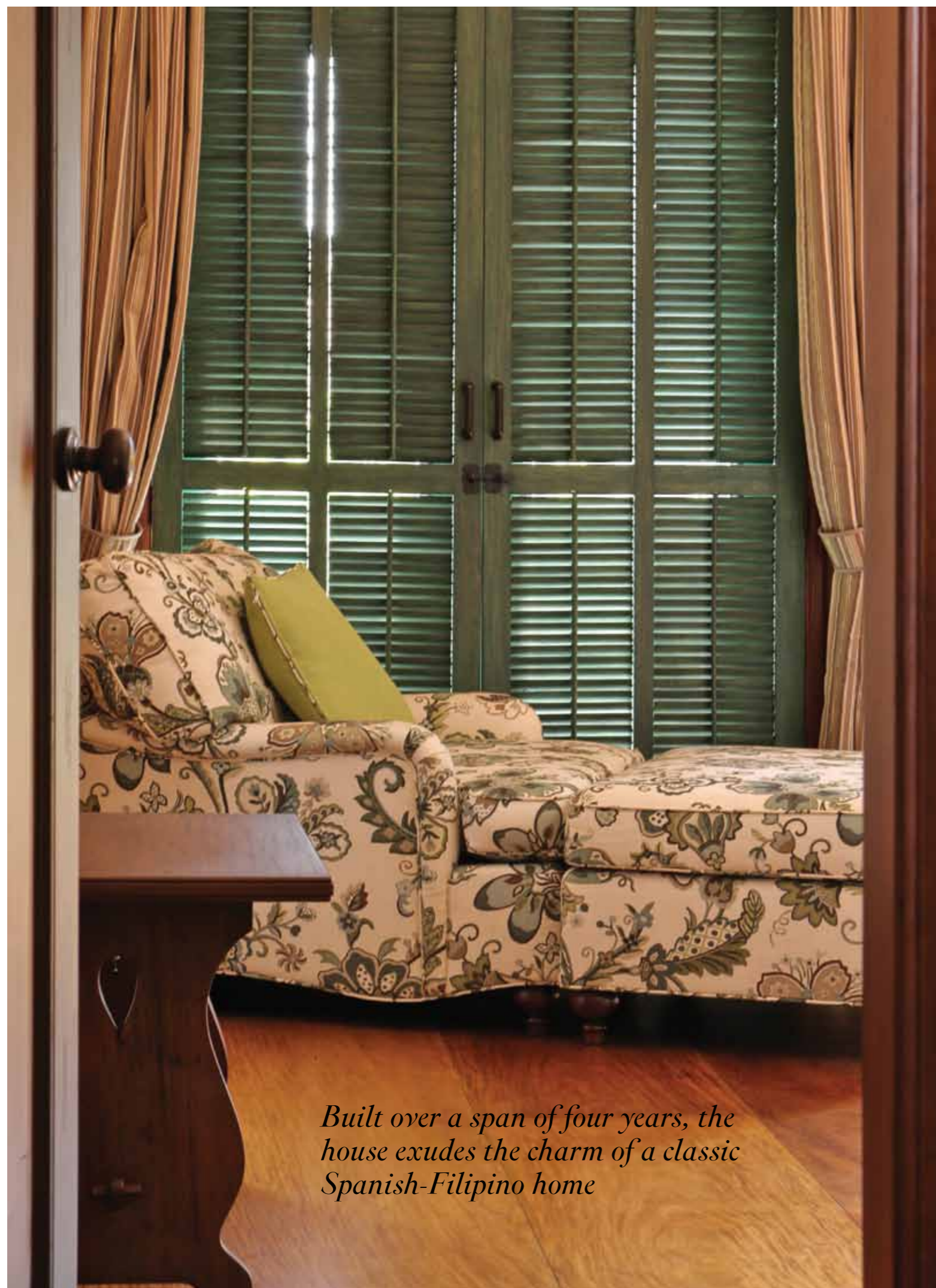
Built over a span of four years, the house exudes the charm of a classic Spanish-Filipino home