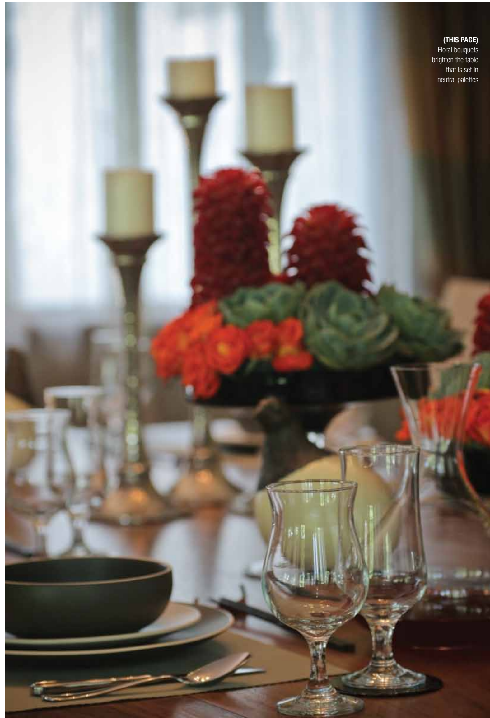
(THIS PAGE) Floral bouquets brighten the table that is set in neutral palettes

The dining room features a solid balayong and narra table; in the charming kitchen, a modern oven is encased in bricks; a spread of Korean fare, the speciality of the house, includes fish cakes, spring rolls, and smoked duck