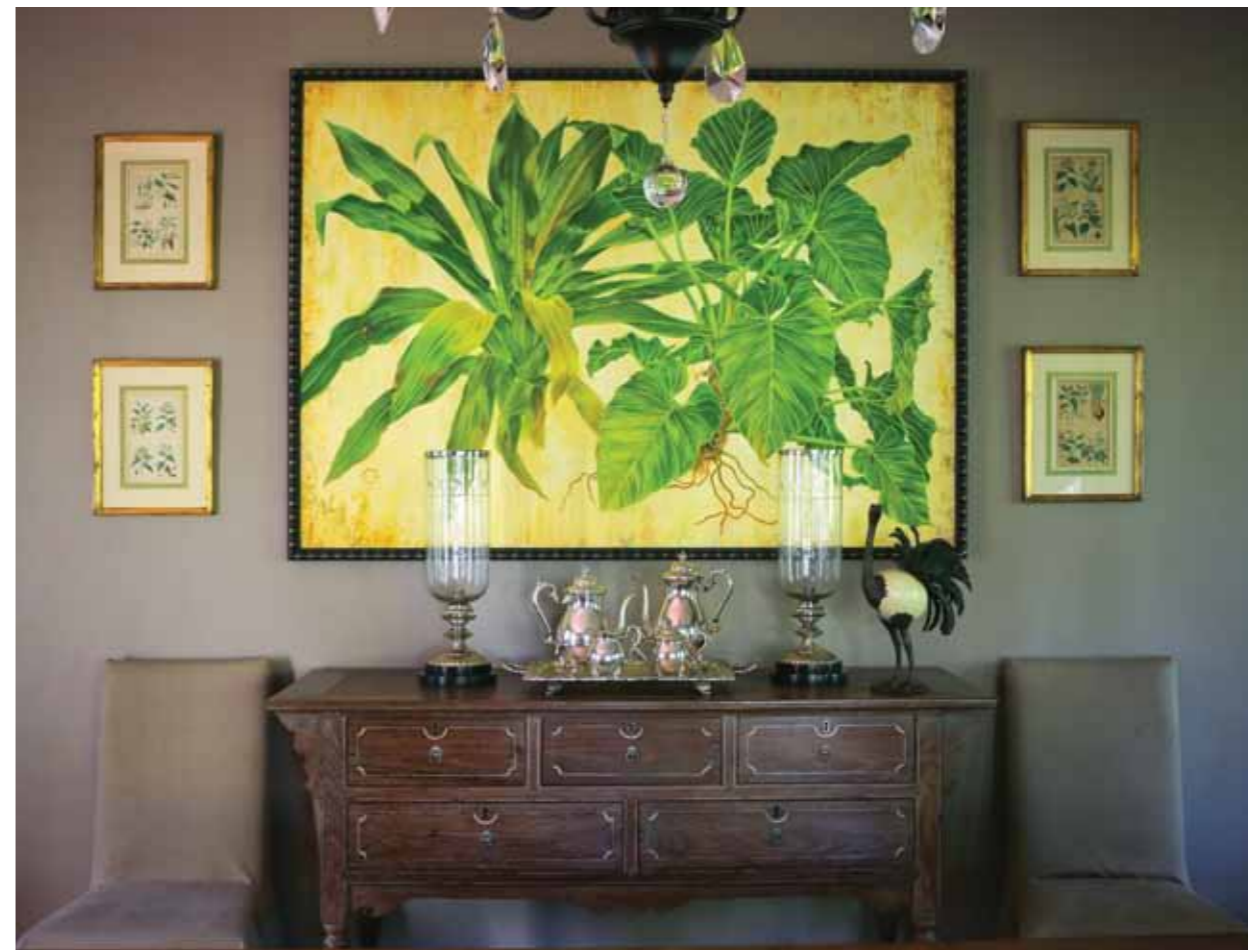
(CLOCKWISE FROM LEFT) The patio where the couple likes to entertain, looks out to a lush landscape; black and white checkered flooring leads to the staircase; a sterling silver tea set sits atop an antique commode in the dining room; the botanical painting is by Dindon Cordova