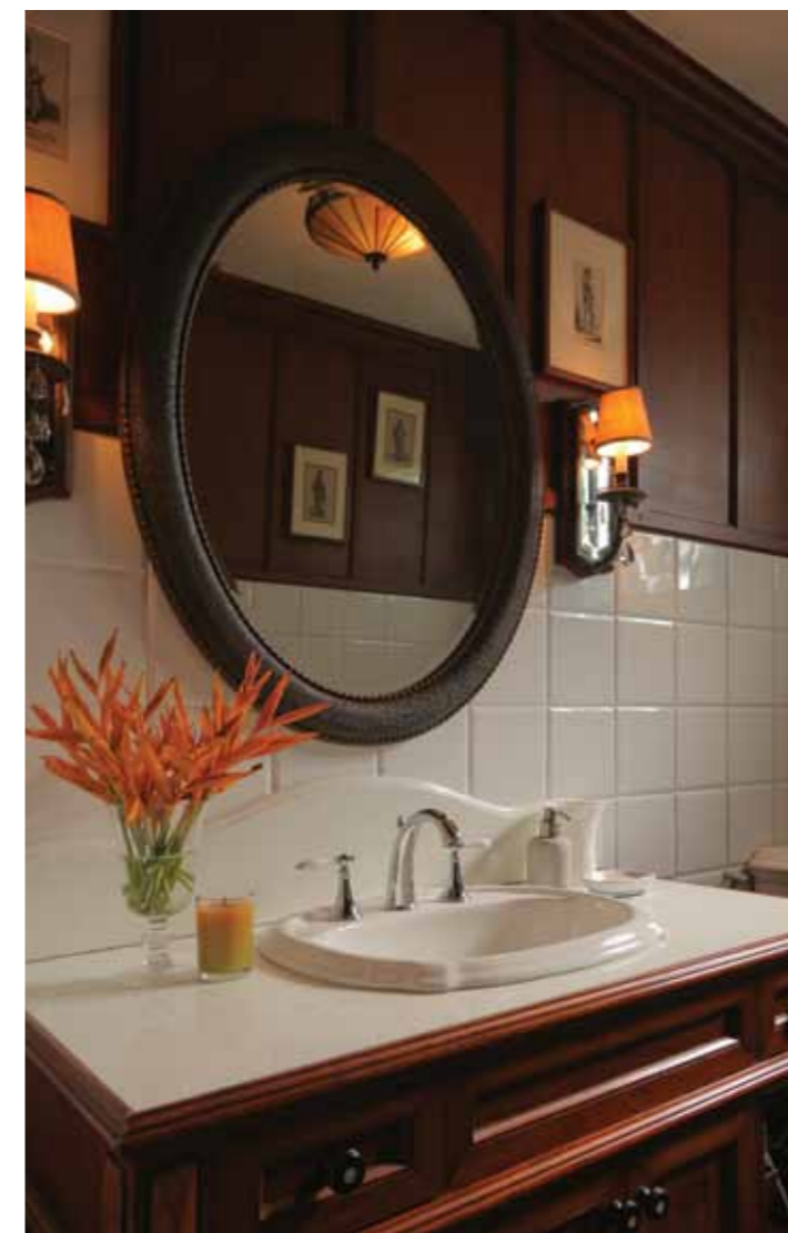
(FROM LEFT) Immaculately white tiles and rich wooden hues give the powder room a timeless appeal; pretty hand-painted walls adorn the nursery