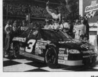
Defending Daytona 500 champ Dale Earnhardt has a regular in Victory Lane — on Thursdays.

DAYTONA BEACH — Dale Earnhardt was his 12th straight twin 125 qualifier at Daytona; Bobby Labonte takes the other. ... Earnhardt displayed the aggressiveness and focus that has brought him seven Winston Cup championships and 32 Daytona victories.