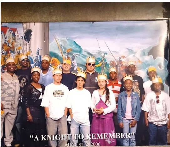
"A KNIGHT TO REMEMBER" AUGUST 2, 2006