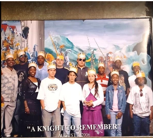
"A KNIGHT TO REMEMBER" AUGUST 2, 2006