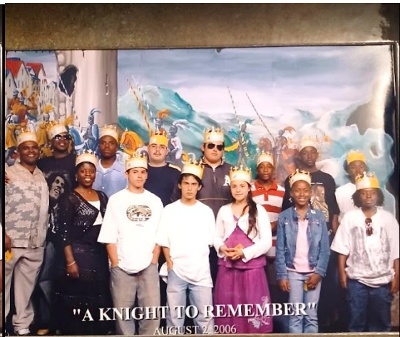
"A KNIGHT TO REMEMBER" AUGUST 2, 2006