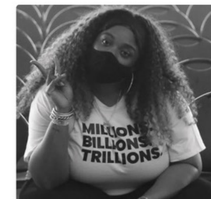
KIERRA SHEARD - KELLY