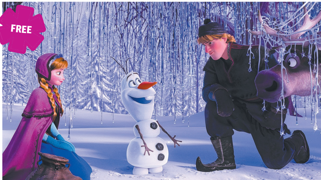
ANIMATED ADVENTURE: Families can enjoy a screening of Frozen at the Spot On Children's Festival at Riverside Theatres, Parramatta.

Explore underground tunnels and fortifications dating back to the 1870s while learning about