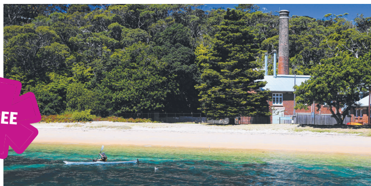
ACTION GALORE: Check out the fun at Sydney Observatory at The Rocks (above left), Sydney Olympic Park (top) and Quarantine Beach at Quarantine Station, Manly (above right).