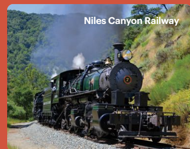
Niles Canyon Railway

Whether you like to walk, jog, skate, bike, or ride a horse, don't miss the Iron Horse Regional Trail. It runs 32 miles, following the Southern Pacific Railroad right-of-way established in 1891, but the most popular stretch parallels downtown Danville. It's perfectly tree-shaded in summer and offers easy access to restaurants and the weekend farmers market.