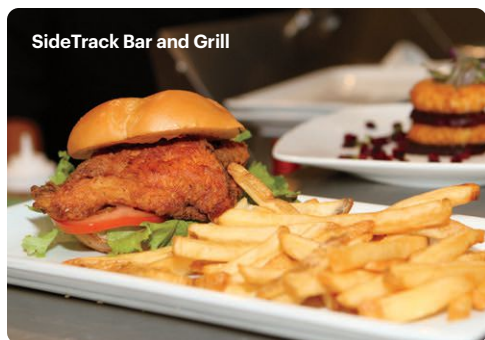
SideTrack Bar and Grill

Fuel up in Pleasanton with an American Wagyu beef burger and spicy Tater Todds at SideTrack Bar and Grill , located near a former Transcontinental Railroad site. Visit the drive-through Meadowlark Dairy