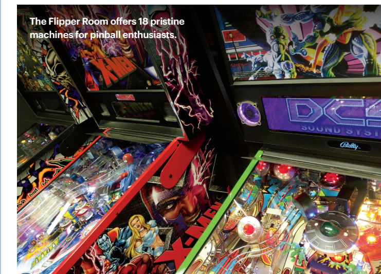
The Flipper Room offers 18 pristine machines for pinball enthusiasts.

This intriguing El Cerrito “museum of fun” features an eclectic collection of boardwalk games and memorabilia from San Francisco's long-shuttered Playland amusement park. playland-not-at-the-beach.org .