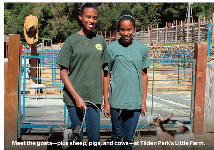
Meet the goats—plus sheep, pigs, and cows—at Tilden Park's Little Farm.

Emerald Glen Park This enormous expanse features bocce courts, a skate park, and an extensive playground known for its water features and slides that snake down rock formations. Dublin, ci.dublin.ca.us.