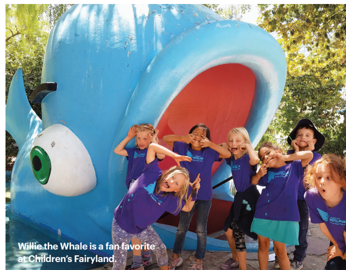
Willie the Whale is a fan favorite at Children's Fairyland.