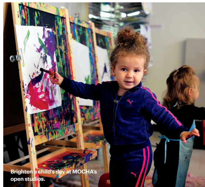
Brighten a child's day at MOCHA's open studios.