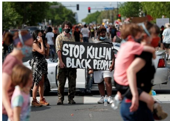
Figure 4: The demonstrators gather on the spot where unarmed George Floyd was killed by a police officer. Two demonstrators are standing in the middle of the road with their hands holding a board written 'Stop Killin' Black People' (Minneapolis, May 26,2020).

Symbol : The cause of chaos is not the black people but the discrimination applied to them.