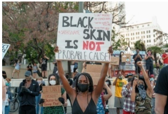
Figure 3: A black-skinned woman is lifting a board with 'Black Skin is Not Probable Cause!' text written on it (Los Angeles, May 27, 2020).

Most of the texts appeared in George Floyd's death demonstrations had black skin themes, like Black Lives Matter , the slogan commonly used for defending black people rights. The form language used was monolingual, that was English. In the photograph, it is told that black people were not the cause of the chaos. It was the unscrupulous white-skinned police officers who had made the lives of black people threatened. It was not just an apology from black people side. In the photograph, the black skinned woman is surrounded by white-skinned people who have the same purposes to stand for the human rights of the members of black community.