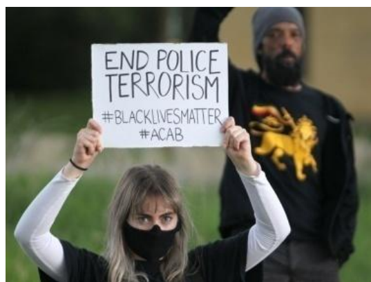
Figure 8: A demonstrant is holding a board with End Police Terrorism #BlackLives Matter #ACAB text written on it (Fish Creek Park, May 31, 2020)

In Figure 8, a woman with a serious face is seen lifting a board with End Police Terrorism #BlackLivesMatter #ACAB text written on it. Again, Black Lives Matter and ACAB codes appear here. These two codes were always seen at any session of the demonstrations. Imperative sentence End Police Terrorism was such a heavy punch to the policemen as by the text they had been labeled as part of terrorism. There were a lot of calls addressed to the policemen, such as bastards, killers, racists, and terrorists. The text illustrates social and psychological condition of the demonstrators at the moment. The expression likely emerged from the demonstrators' minds who had been very annoyed with the policemen whose behaviours and deeds did not reflect their own characters at all. Their actions looked inhuman and showed no ethics. It symbolizes that most of American people did not respect to or even obey the police. People all over the world hate racism behaviour. Nearly all countries in this world have sounded their voices on equivalence, including the United States. Strangely, it is in America where racial behaviours are just growing high. Here, the suspects of racism were frequently out of punishment and government's policies tended to marginalize the minority groups as well. Therefore, the actors of racism were popularly nicknamed 'terrorists with governmental protection'.