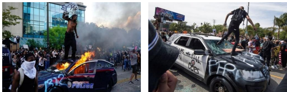
Figure 5 (left) and Figure 6 (right): The rage of demonstrators reaches its climax and they release it by destroying, scratching, and burning police cars.

and angry over policemen's brutalities. The policemen have frequently shown racism and discriminative actions toward black people. It leads to the rage of the demonstrators which results in the destruction of the police cars. There are at least two common slogans appearing in both pictures, i.e.: ACAB and 1312. ACAB is the abbreviation of All Cops Are Bastards whereas 1312 is the code of ACAB in numeric form (1: A, 3: C, 2: B). 'Bastard' is a swear word for showing anger. In the case, it sounded the demonstrators' expression on the policemen's unethical and extremely dirty deed by pressing a minority group.