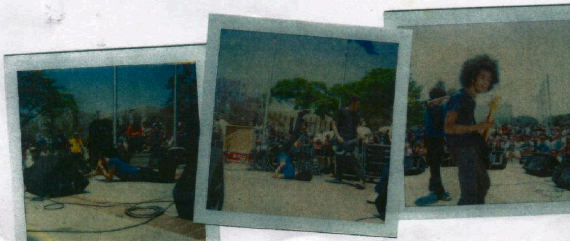
photos (top-left) Cedric Bixler-Zavala at the This Ain't No Picnic Festival, Irvine Canyon, CA, July 8, 1999 ; (Polaroids) At the Drive-In at Cal State Fullerton, 1999