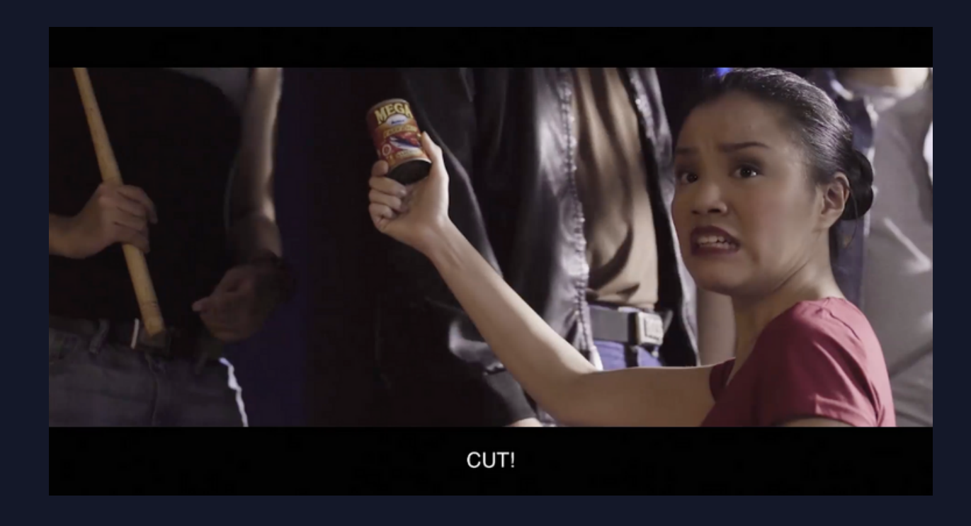
Episode 2 | Eksena ni EXTRA