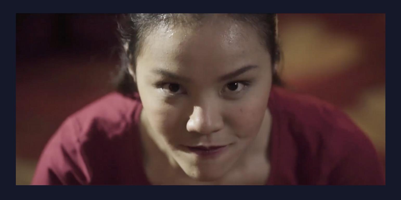
Episode 3 | Lights, camera, EXTRA!