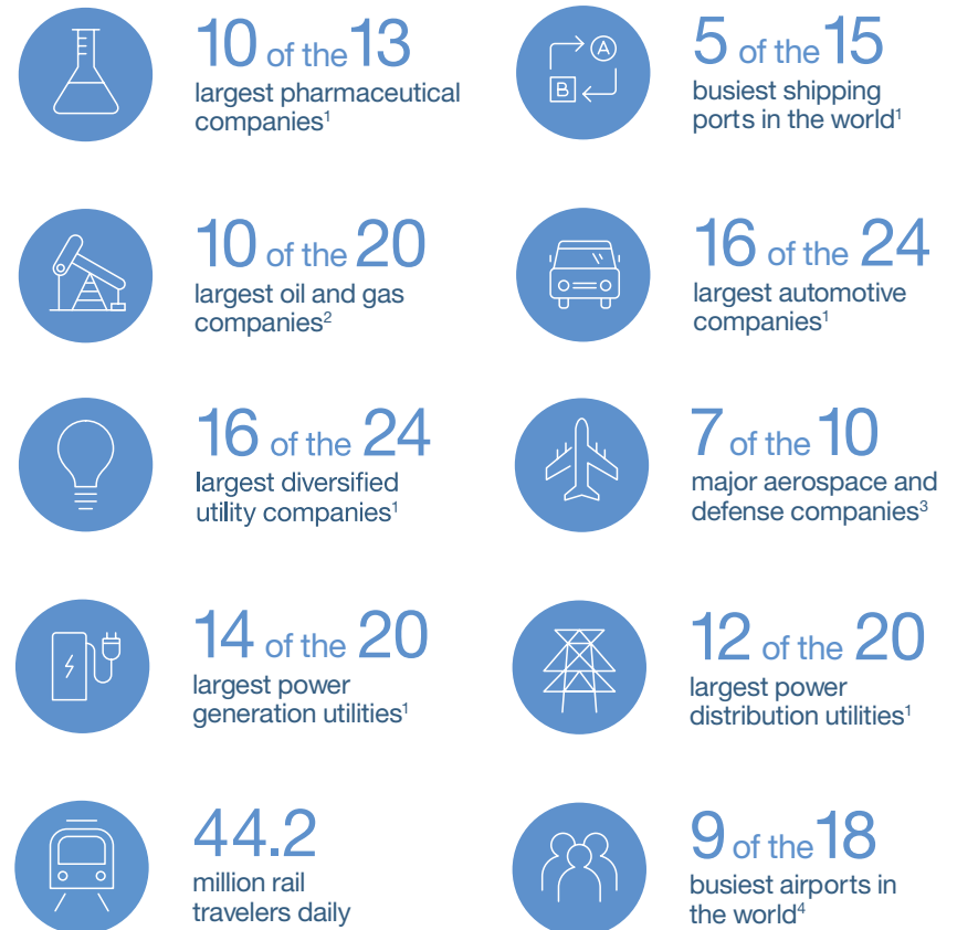
Figure 2: IBM Maximo manages the world's most asset-intensive organizations