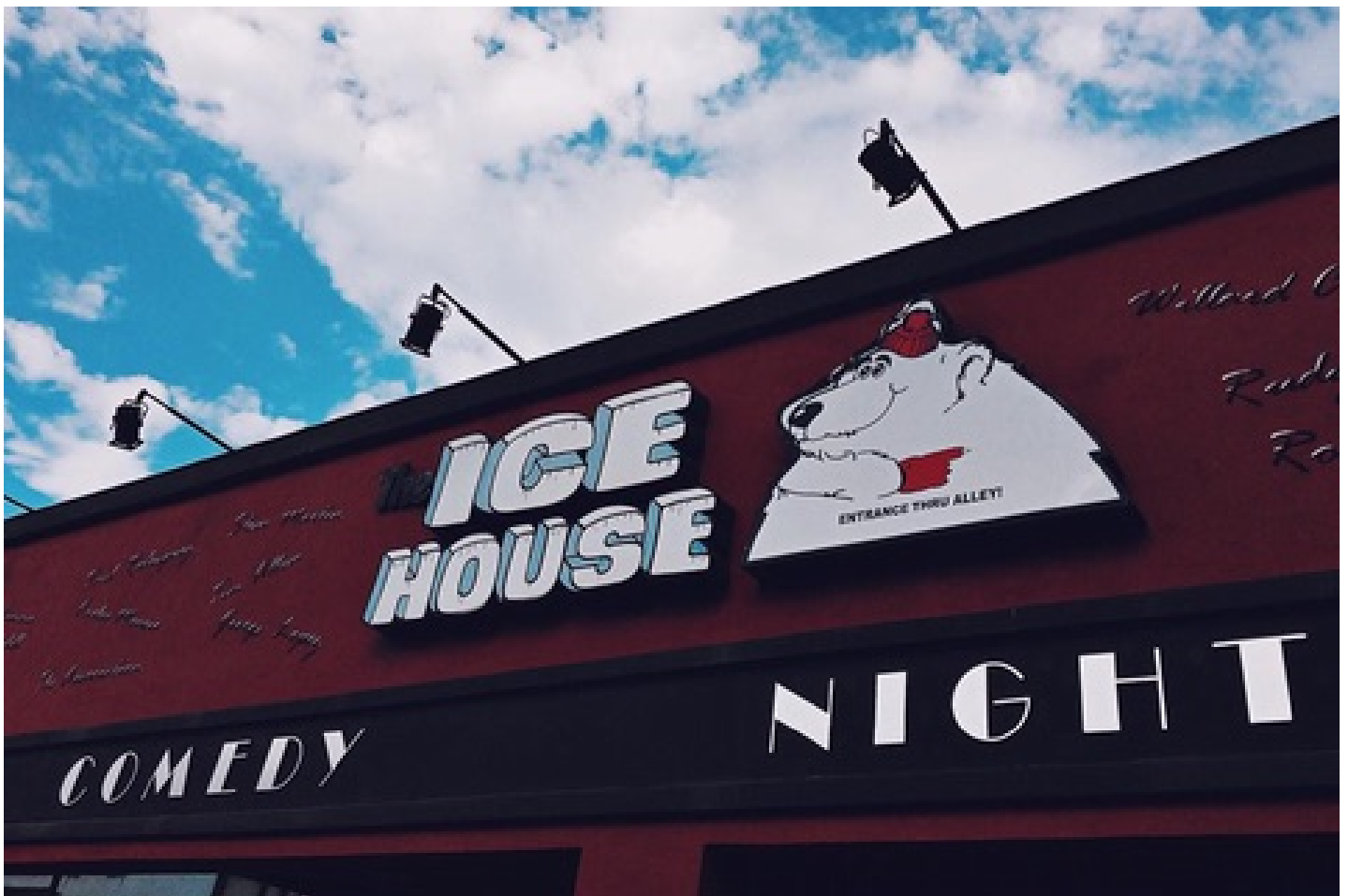
( https://www.instagram.com/p/7eIYO1HrE4/ )

Image courtesy of @instagrash ( https://www.instagram.com/p/7eIYO1HrE4/ )